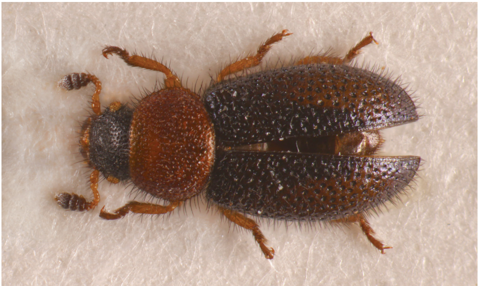
Figure 3. Habitus of the first record of Opetiopalpus sabulosus Motschulsky, 1840. Multiple photographs were taken using a stereo microscope (Olympus ZX 10) and a camera (Panasonic Lumix GH4), and rendered with a focus stacking software (Helicon Focus version 6.0). The specimen is stored in the collection of Manfred Kahlen at the “Tiroler Landesmuseen Betriebs G.m.b.H., Naturwissenschaftliche Sammlungen, Sammlungs- und Forschungszentrum in Hall in Tirol”, Tyrol, Austria.

The records on our P2000_1 and P2500_2 sites could indicate a small and cryptically living population adapted to inner-Alpine and steppe-like dry grasslands as well as rocky alpine landscapes. The fact that the specimens were found after two years underlines the presence of a small population of O. sabulosus in the LTSER area “Val Mazia/