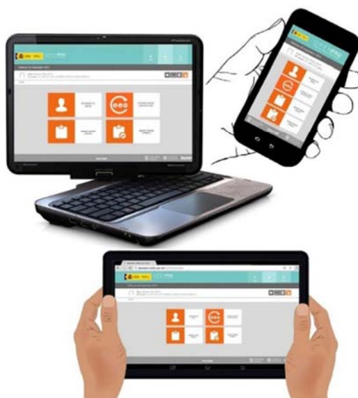
Figure 1: Language learning m-learning environments of the OPENPAU project (Spain) [Magal-Royo, 2017]

become a prevailing trend within e-learning [Ozdamli, 2015] [Uzunboylu, 2015] that has led to the increasing importance of ubiquitous learning environments (u-learning) [Casey, 2005]. Adaptive mobile assessment systems have been developed in a number of cases [Huang, 09] like the SEMS [Kaiiali, 16] but none for foreign language learning. Thus, the importance of combining both issues represents a great advantage for many institutions in external standardized exams such as the university entrance examinations worldwide [García Laborda, 2016]. However, it is necessary to improve means and methods to achieve better listening sections that overcome the current problems in listening tasks in mobile devices. To achieve this goal it is necessary to find new multimodal ways to make listening task more efficient and adequate to the need of mobile devices. As it can be seen in figure 1, from the OPENPAU project (Spain) (FFI2011- 22442), there is variety of m-learning scenarios where listening for language learning takes place.