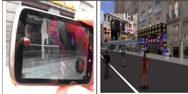
Figure 2: System view for participants in the real world (left) and the mirror world (right)

on the boulevard. Participants easily solved this problem by using the chat option. The second problem was due to the superposition of avatars on the mobile screen. When participants in the real world did not visually perceive their partners' presence, they felt partially disconnected. The need to see and hear their partners in order to feel totally immersed was evident.