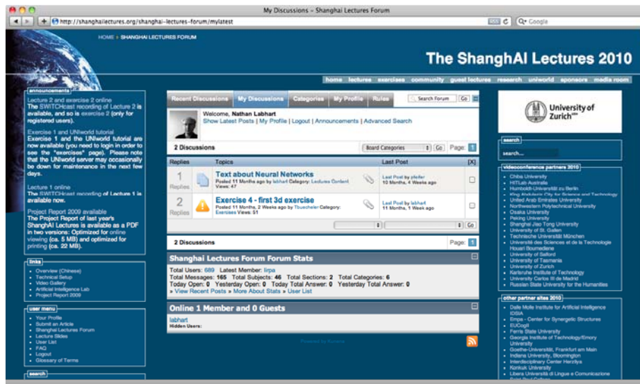
Figure 2: Community feature (forum) on the ShanghAI Lectures website (2010, look and feel identical to 2009)