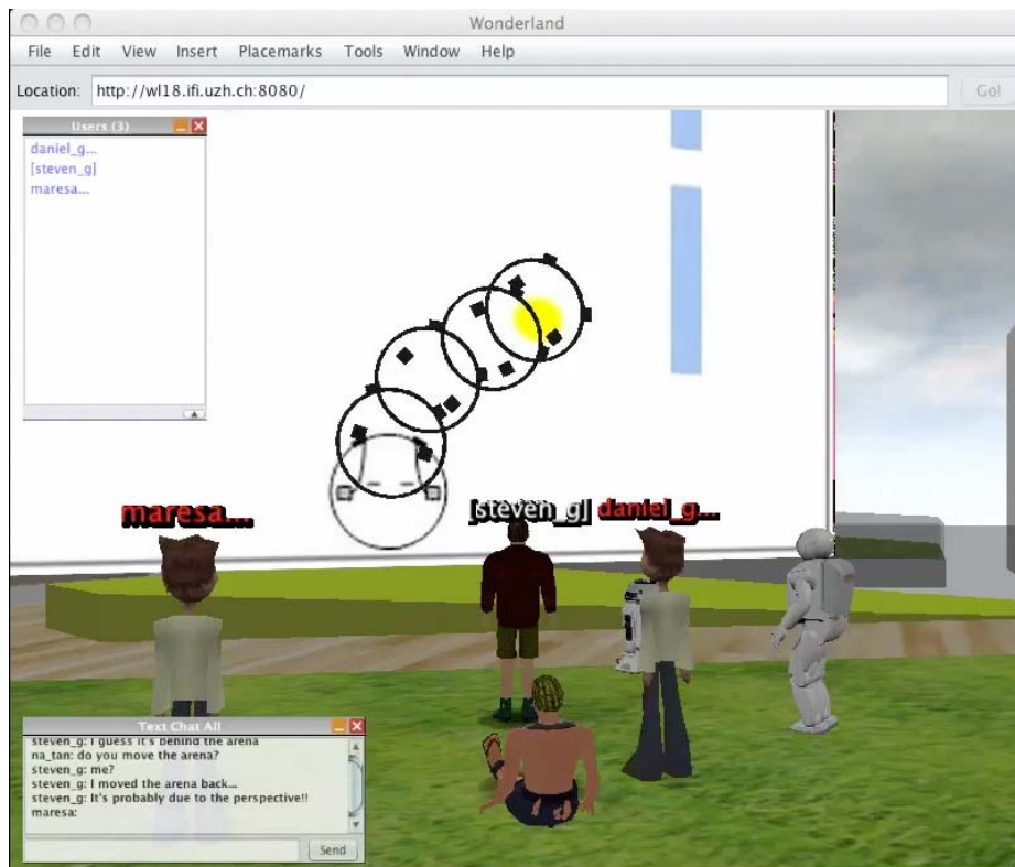
Figure 4: Group exercise in UNIworld

For collaborative learning in UNIworld to run smoothly it is crucial that each participating university provides their students with access to the 3D CVE from a local computer lab, as well as technical support.