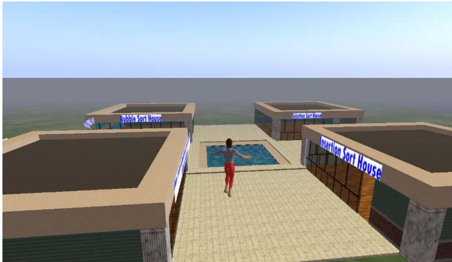
Figure 1: The Algoritmia Island

A virtual world was implemented, called Algoritmia Island, in which students could visit different thematic houses where they were taught about sorting algorithms. In the thematic houses students found different animations, notice boards, exercises, links to web pages, QR codes, videos of animations on sorting algorithms, and other educational materials.