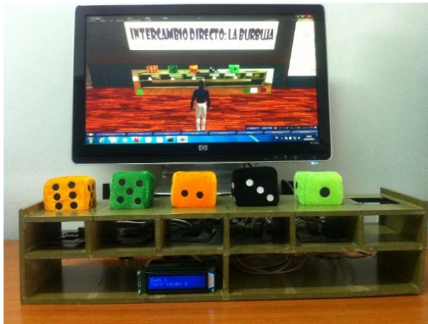
Figure 5: Mixed reality: the “array” tangible interface

The tangible interface had five holes representing the five vector elements. Cubes (dices) were used to represent the values of the elements of the array (see Figure 5). RFID readers were used to read each element of the array: RFID tags were inserted inside the cubes. The values of the different positions of the array were sent to a simulation of the array that was represented inside the virtual world, and which was synchronously updated using this information. The tangible interface also featured an LCD display that showed auxiliary messages, such as the number of iteration during a sorting process.