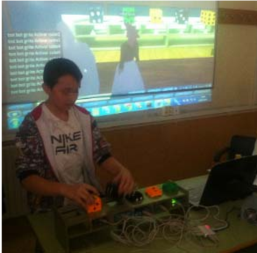
Figure 6: A student using the tangible interface

In order to promote collaborative work, the teacher finally proposed an activity in which two teams competed to sort as quickly as possible a given array. In the virtual island there were two boards on the ground, one for each team, and a giant dice. One of the members of the team was in charge of moving the cubes in the virtual world for each iteration of the algorithm. So they used chatting to coordinate the work and to achieve the correct ordering. This activity allowed students to work the skills acquired in the virtual world and to organize themselves for collaborative work.