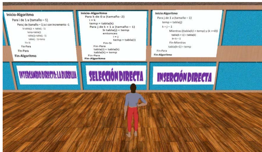
Figure 3: Example of explanatory panel in a thematic house

Each thematic house offered various resources for learning sorting algorithms (see Figure 2 and 3): a running simulation of the algorithm, a panel with the pseudo code of the algorithm, links to web pages with additional material, etc.