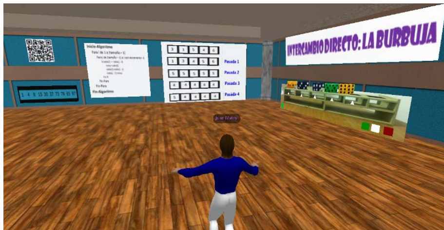
Figure 2: the Bubble Sort Thematic House