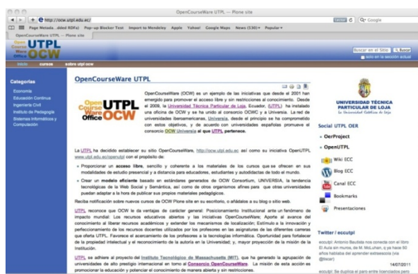
Figure 4: UTPL OpenCourseWare Web site

To conclude this section, we give other interesting details related to OCW-UTPL structure. OCW-UTPL used the Educommons platform ( http://plone.org/products/eduecommons ). EduCommons is designed for the creation of OCW projects. EduCommons is a content management system, not a learning management system, because it does not include an assessment process and support for interactive tasks (blogs, chat, wikis, etc.). It is an administration system configured mainly using Python, Zope and Plone technologies. Also, it is distributed under a GNU General Public License. Thus, this assessment ensured excellent work flow management, i.e., dissemination of educational contents.