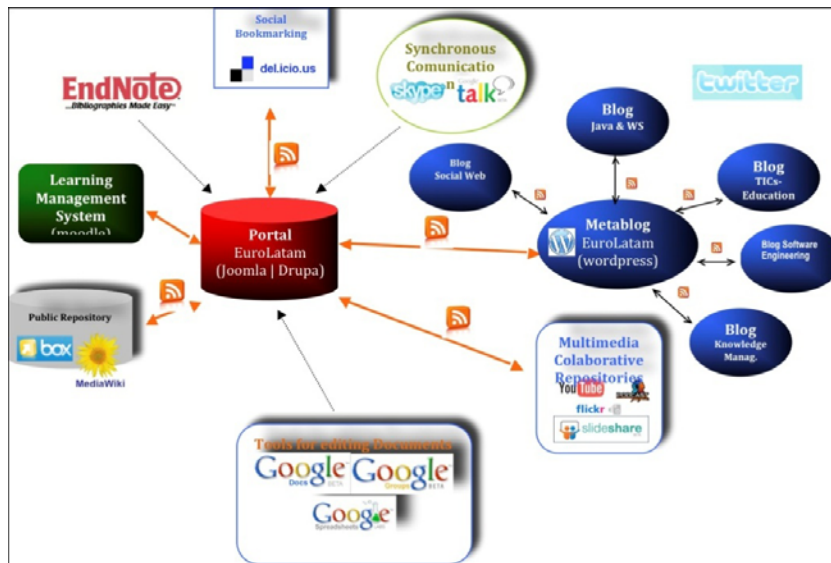
Figure 1: Technological Framework for Engineering UPM and UTPL Academic and Research Networks

This setup led to the establishment and management of several research lines by organizing PhD course resources. Also, it included a set of Web 2.0 technologies that were applied to the development of other training programmes, e.g., EHEA-compliant master's degrees. Consequently, this framework was the factor that had the biggest impact on the later development of joint international projects started up by this group of researchers.