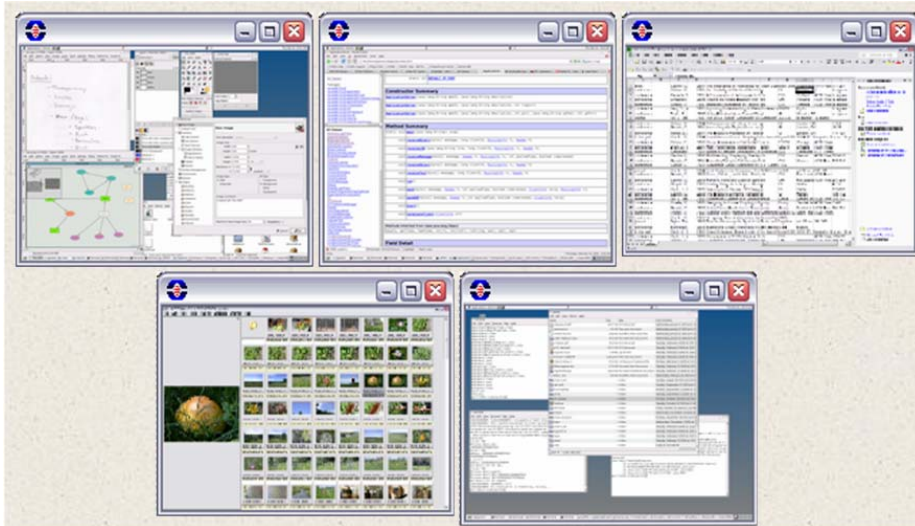
Figure 1: Multi-VNC, showing five collaborator's screens scaled to fit onto a secondary screen. The user's main screen is not shown.

Even this simple setup showed that some of the community-based principles are valuable. Multi-VNC allows group members to see each others' work in general (what applications are running, but not data in those applications), allows people to send text messages to one another, allows pointing from the overview to the original screen, and allows people to zoom in to a full share with the other person's system. There were two clear disadvantages, however. First, all the connections, scaling, and zooming had to be done manually, with commands issued through the VNC control dialogs. This was difficult and time-consuming; it is clear that this is not a viable alternative for a real work community without a wrapper application that simplifies connections and provides shortcuts for common functions like zooming in to another person's workspace. Second, Multi-VNC provides no representation of people. This makes it difficult to remember which workspace belonged to whom, and difficult to determine who was active or away from their computer. Furthermore, it was impossible to see who was looking at your screen, and whether other people in the group were involved in collaboration. Again, however, it is possible that a wrapper application could provide embodiments that would convey this information.