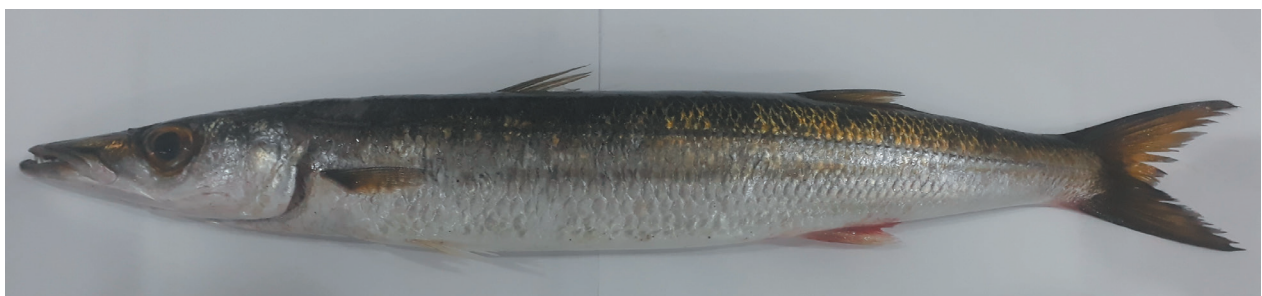
Fig. 2. Specimen of Sphyraena flavicauda caught at Chetaibi, Algeria in February 2019 showing the position of the dorsal, pectoral, and ventral fins and the lower brownish-yellow longitudinal strip