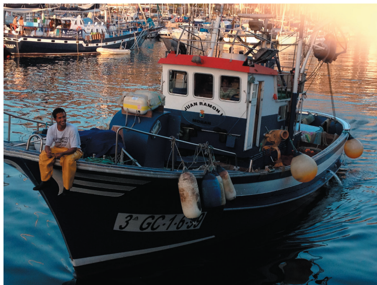
Fig. 2. A typical artisanal fishing vessel from the Canary Islands

production. According to official statistics, the potential employment was estimated at 1600 jobs in artisanal extractive fishing and aquaculture for 2017–2019. However, it is necessary to consider the generation of employment by the fish processing industries, fish commercialization, and other indirect jobs, namely those related to the activities of stowage, storage, construction, and repair of marine equipment for fishing (ISTAC, the Canary Institute of Statistics 2019*).