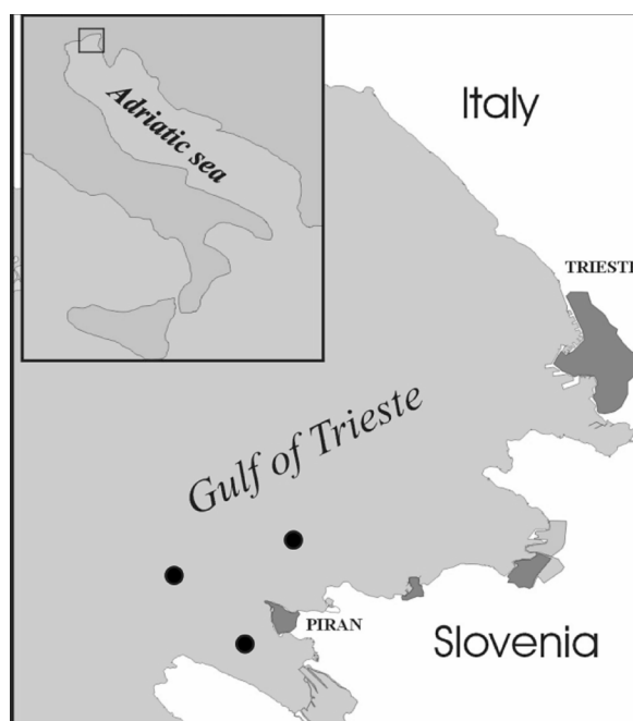
Fig. 1. Map of the studied area with sampling sites where Mustelus punctulatus , were caught from June 2002 to June 2003

where IRI_f is the IRI value for each prey category f .