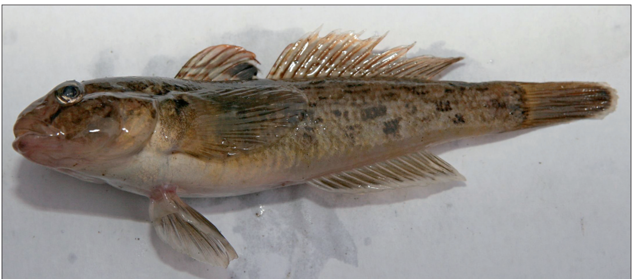
Fig. 2. First recorded specimen of Neogobius melanostomus in Belgium (10.5 cm TL)