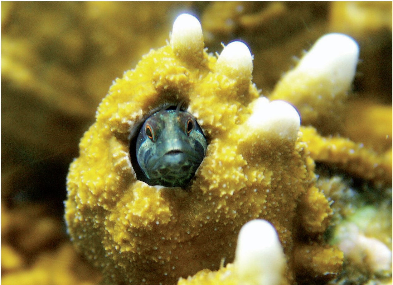
Fig. 3. Male of Coralliozetus cardonae inhabiting tubes previously occupied by spiral-gilled worm Spirobranchus spp., surrounded by the fire coral (Hydrozoan) Millepora alcicornis , in south coast of Península de Paria, Venezuela

Description and distinctive characters. Coralliozetus species have the following characteristics: (i) They are small in size, with a maximum length of ~37 mm SL in C. micropes (see: Stephens 1963), in C. cardonae with a maximum length record of ~25 mm SL (Acero 1987). The largest specimen of C. cardonae that we examined is a male 28.84 mm SL (MHNLS 24610). (ii) The presence and variations in the form of supraorbital cirri differentiate the genera of Atlantic Chaenopsidae (Stephens 1963, Stephens et al. 1966, Acero 1984, Hastings 1997, Williams 2003). Coralliozetus species have one or two pairs of simple, non-branching supraorbital cirri, originating over the centre of the top of each eye. In C. rosenblatti is present a flaplike supraorbital cirrus. In C. cardonae there are two pairs of ocular cirri; the anterior most cirri are larger, up to longer than the ocular diameter in males and shorter in females, and the rear cirri smaller in both sexes. (iii) The dorsal fin of Coralliozetus species has 28–33 elements. In C. cardonae the dorsal fin has XVI–XIX spines, and 11 to 13 soft rays, for a total of 28 to 32 elements. (iv) Distinct flag-like membrane sometimes on anterior edge of dorsal first spine in males.