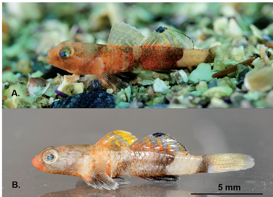
Fig. 1. Lebetus guilleti ; (A) in its natural habitat, (B) five days after fixation; photographed by Semih Engin

The presently reported finding of L. guilleti from the Sea of Marmara constitutes its first record from the north-eastern part of the Mediterranean Sea (Fig. 1).