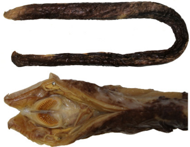
Fig. 1. Myxine circifrons , 545 mm in total length (UCR 2008-003), caught off Costa Rica (9°33'25"N, 85°22'0"W); Above, entire specimen, lateroventral view; below, cups and basal plates in excised and spread condition, dorsal view

Blanco, Costa Rica, 9°30'0"N, 85°5'39"W, at a depth of 637–665 m, on September 1992, by W. Valdelomar), and UCR 2705-007 (one specimen collected 13 km SW from off Cabo Blanco, 9°29'49"N, 85°13'27"W, at a depth of 80–210 m, on October 2010, by H. Araya). Recently, these specimens were identified by us as Myxine circifrons (UCR 2008-003 and UCR 2290-002; Fig. 1) and Eptatretus stoutii (Lockington 1878) (UCR 2705-007; Fig. 2). In this paper these new records are reported and discussed.