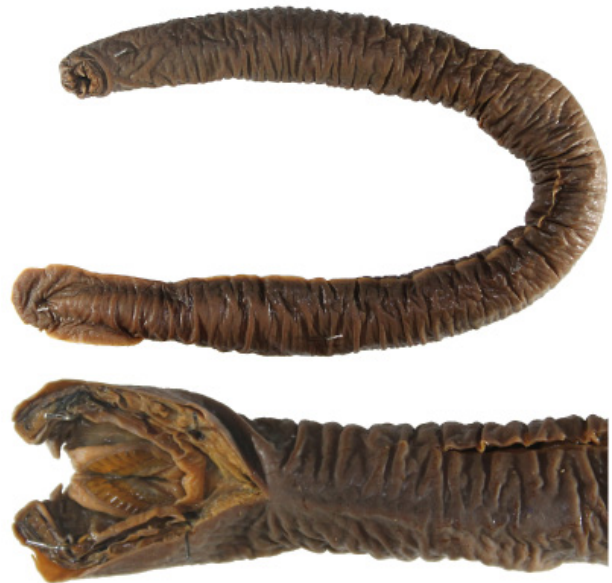
Fig. 2. Eptatretus stoutii , 351 in total length TL (UCR 2705-007), caught off Costa Rica (9°29'49.99"N, 85°13'27.54"W). Above, entire specimen, lateroventral view; below, cups and basal plates in excised and spread condition, dorsal view