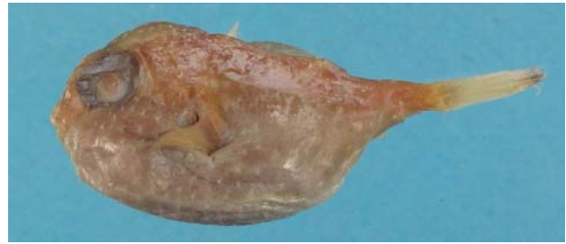
Fig. 1. Tylerius spinosissimus , Lateral view; HUI 17441, 38.6 mm SL, 9 July 1992, Eilat, Israel, Gulf of Aqaba, Red Sea

In the Red Sea, other suitable habitats for this species are found throughout the lower continental shelf of the main body and the Gulf of Aqaba. The species probably dispersed into the eastern Mediterranean Sea through the Suez Canal by means of its pelagic larvae; the existing records from three distant areas in the Mediterranean suggest that the species has already established reproducing populations, and additional records are expected.