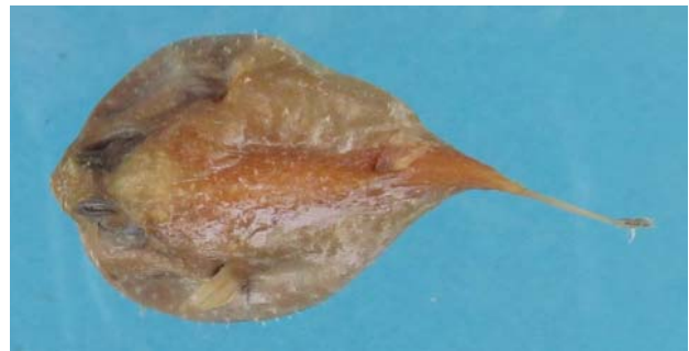
Fig. 2. Tylerius spinosissimus , Dorsal view; HUI 17441, 38.6 mm SL, 9 July 1992, Eilat, Israel, Gulf of Aqaba, Red Sea; Photograph by Daniel Golani