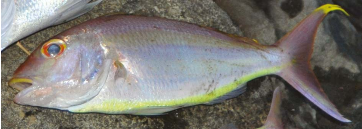
Fig. 2. Nemipterus isacanthus taken by handline from Kamiali Wildlife Management Area, Papua New Guinea on 11 September 2014