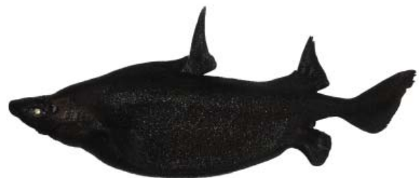
Fig. 1. Oxynotus japonicus Yano et Murofushi, 1985, NMMB-P23359, female, 610 mm TL, fresh

Material. NMMB-P23359, female, 610 mm TL, Daxi fish market, trawled on the slop near Kueishan Island, north-eastern Taiwan, 21 March 2015, ca. 300 m, coll. H.-C. Ho.