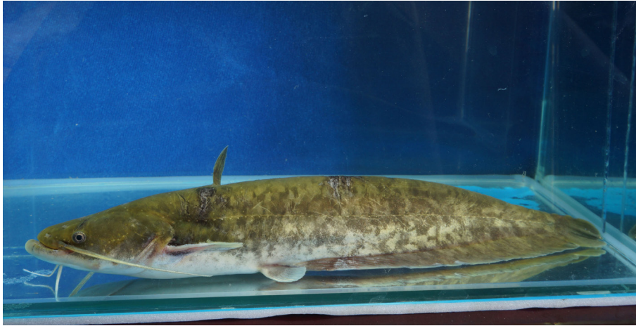
Fig. 3. The Amur catfish, Silurus asotus , caught in the Tibet stretch of the Lancang River, China

the local ecosystems and therefore they are determined to release all kinds of fish that are available on the market.