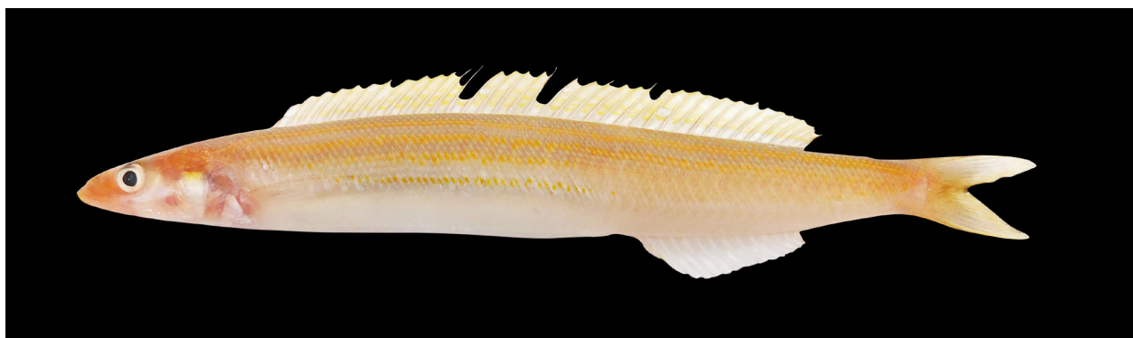
Fig. 1. Lateral image (freshly caught) of Bleekeria kallolepis (BNHS MF 17, 140.1 mm TL)

Bleekeria kallolepis , locally called “ aruna ” (in Tamil), are regularly caught by trawlers operating within 80 m (mostly within 40 m) depth along the east coast of India and locally marketed for domestic consumption (Rajapackiam and Mohan 2012). After the original description, species name was rarely used in the scientific literature. Ida et al. (1994) mentioned a 103 mm SL specimen in the BMNH from Madras as the holotype and Fricke et al. (2018) provided holotype details of BMNH 1846.11.22 (Fig. 3–4), other B. kallolepis material mentioned in Ida et al. (1994) came from Torutua National Park, Andaman Sea, Thailand, which needs verification.