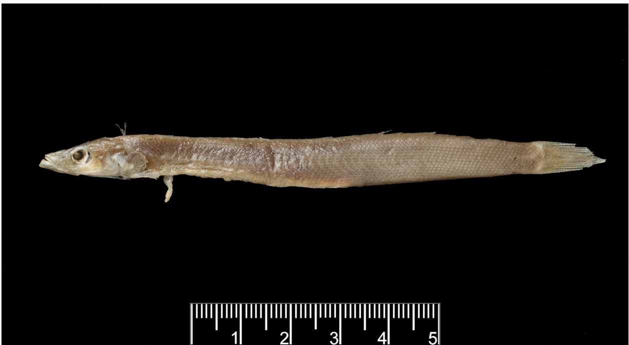
Fig. 4. Holotype of Bleekeria kallolepis (103 mm SL, BMNH 1846.11.22 Anonymous 2014)