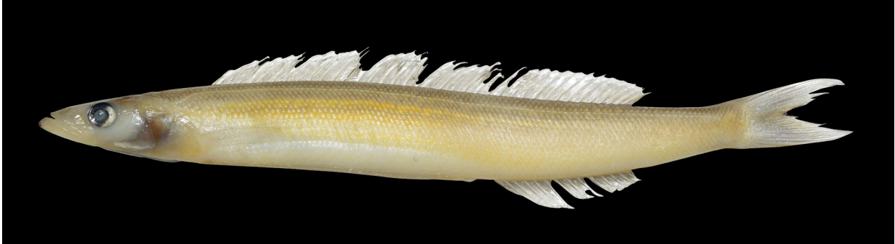
Fig. 2. Lateral image (formalin preserved) of Bleekeria kallolepis (BNHS MF 17, 140.1 mm TL)

Scientist-in-Charge, Chennai RC, CMFRI is acknowledged for the facilities extended. The EAF-Nansen