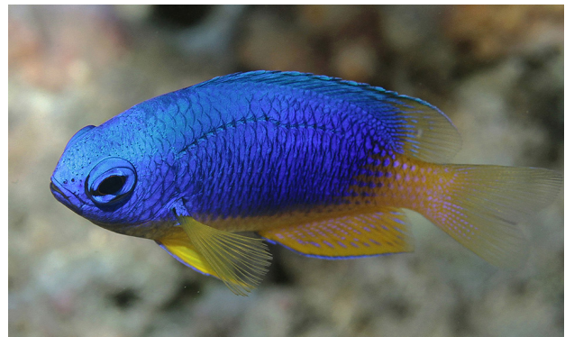
Fig. 2. Pomacentrus caeruleus ; individual photographed at Reunion, ca. 3 cm SL