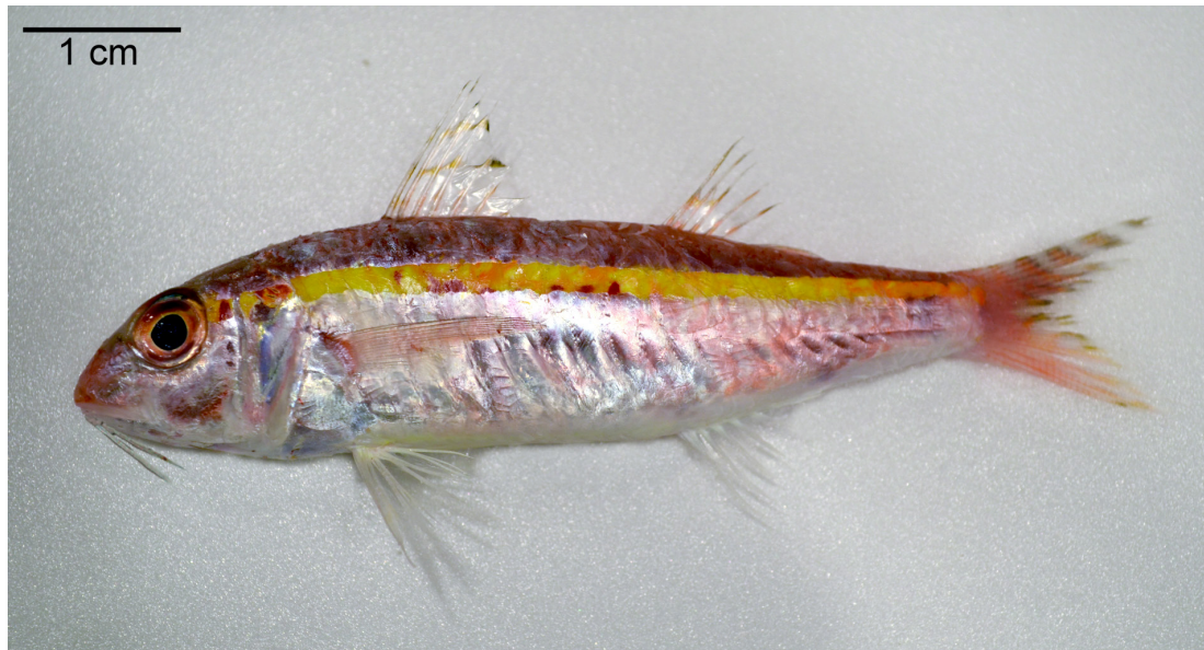
Fig. 2. Female specimen of Upeneus moluccensis , MAREM LAR-182, 108.5 mm SL, off Aksaz, western Sea of Marmara, Turkey