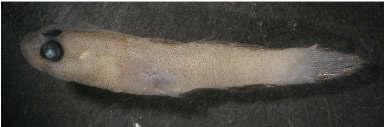
Fig. 3. Odondebuena balearica , PMR VP4140, male, 19.2 + 4.3 mm (SL + caudal = TL), Torrevieja, Spain, Western Mediterranean

Remarks. The presently reported specimen of O. balearica clearly differs from all other gobiid species known in the CLOFNAM area by the characters listed in diagnosis and also by additional characters in the short description. It matches well the earlier published morphologies of O. balearica (see Miller and Tortonese 1968, Kovačić and Golani 2007), except for the missing preopercular canal.