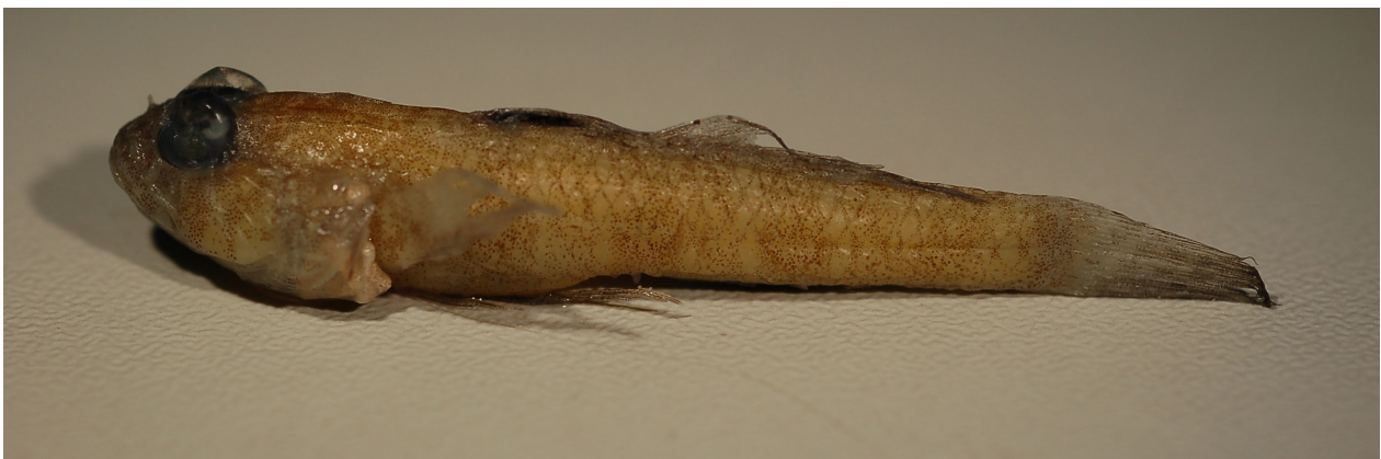
Fig. 4. Vanneaugobius dollfusi , PMR VP3865, male, 32.0 + 8.1 mm (SL + caudal = TL), Llevant Menorca (Maó), Balearic Islands