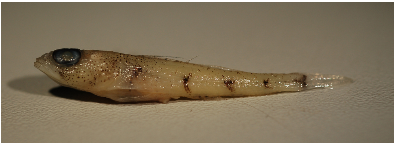
Fig. 2. Buenia massutii , PMR VP4124, female, 25.4 + 5.8 mm (standard length + caudal = total length), Alboran Island, Spain, Western Mediterranean, photo M. Kovačić