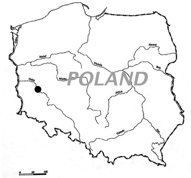
Fig. 1. The location of the sampling site of zope, Abramis ballerus , in the middle stretch of the Odra River