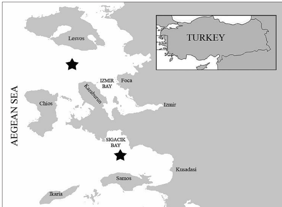
Fig. 1. Map of the sampling area; asterisks show the locality of captured Epigonus constanciae specimens in the central Aegean Sea