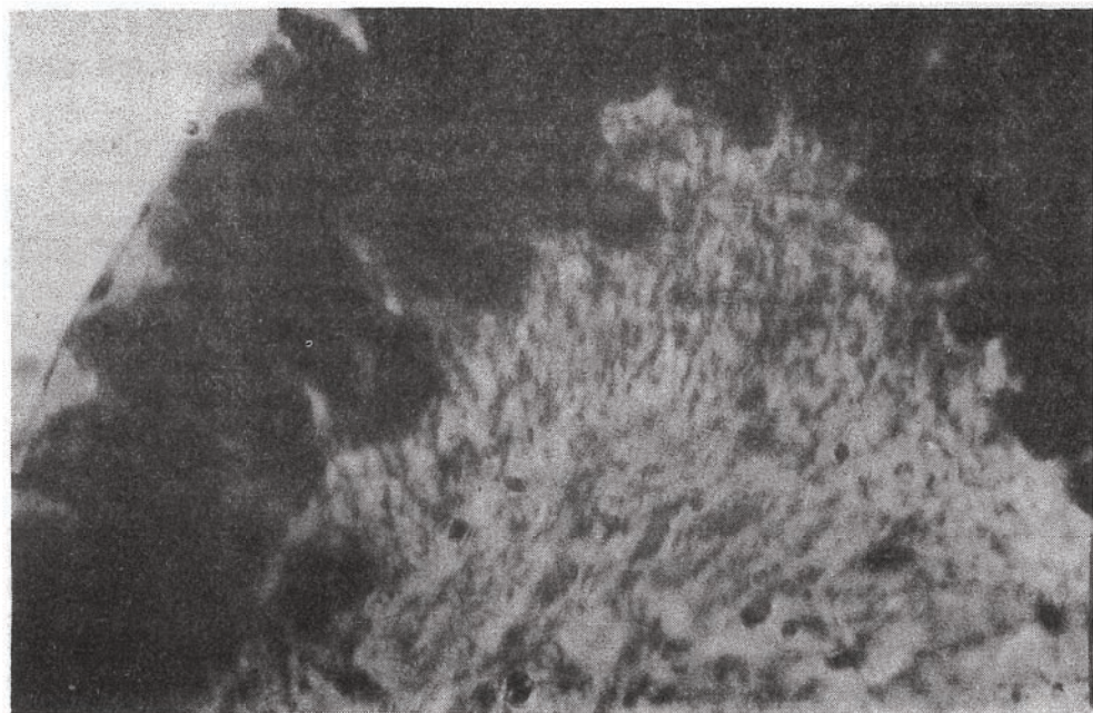
Phot. 4. A cross-section through an eel gill filament. Positive reaction for AMPS in the mucus cells of the branchial epithelium. Toluidine blue. x 1200