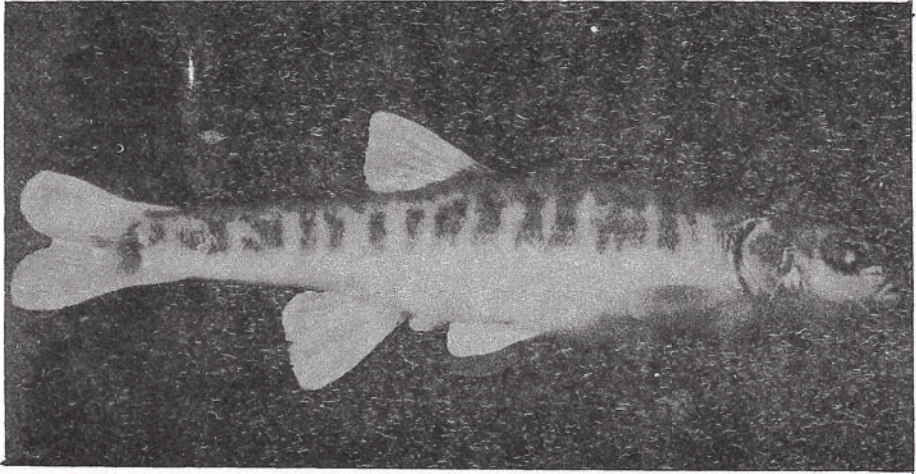
Fig. 1. Phoxinus phoxinus from the river Skawa (longitudo corporis 78 mm), female

The present study was aimed at examining the morphology of Ph. phoxinus from the river Skawa, an upstream tributary of the Vistula. Studies on Ph. phoxinus morphology in the Vistula catchment area were based on numerous observations in the streams of Mszanka (Starmach, 1963) and Sowlinki (Kulamowicz and Jażdźewski, 1970), and in the river Sufraganiec (Kulamowicz and Korkuć, 1971).