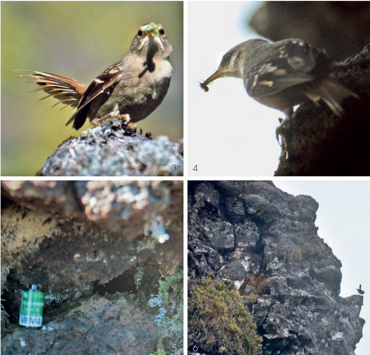
Fig. 3. Brood-caring Másafuera Rayadito Aphrastura masafuerae carries two small green lepidopteron larvae to the nest hole for feeding the nestlings.