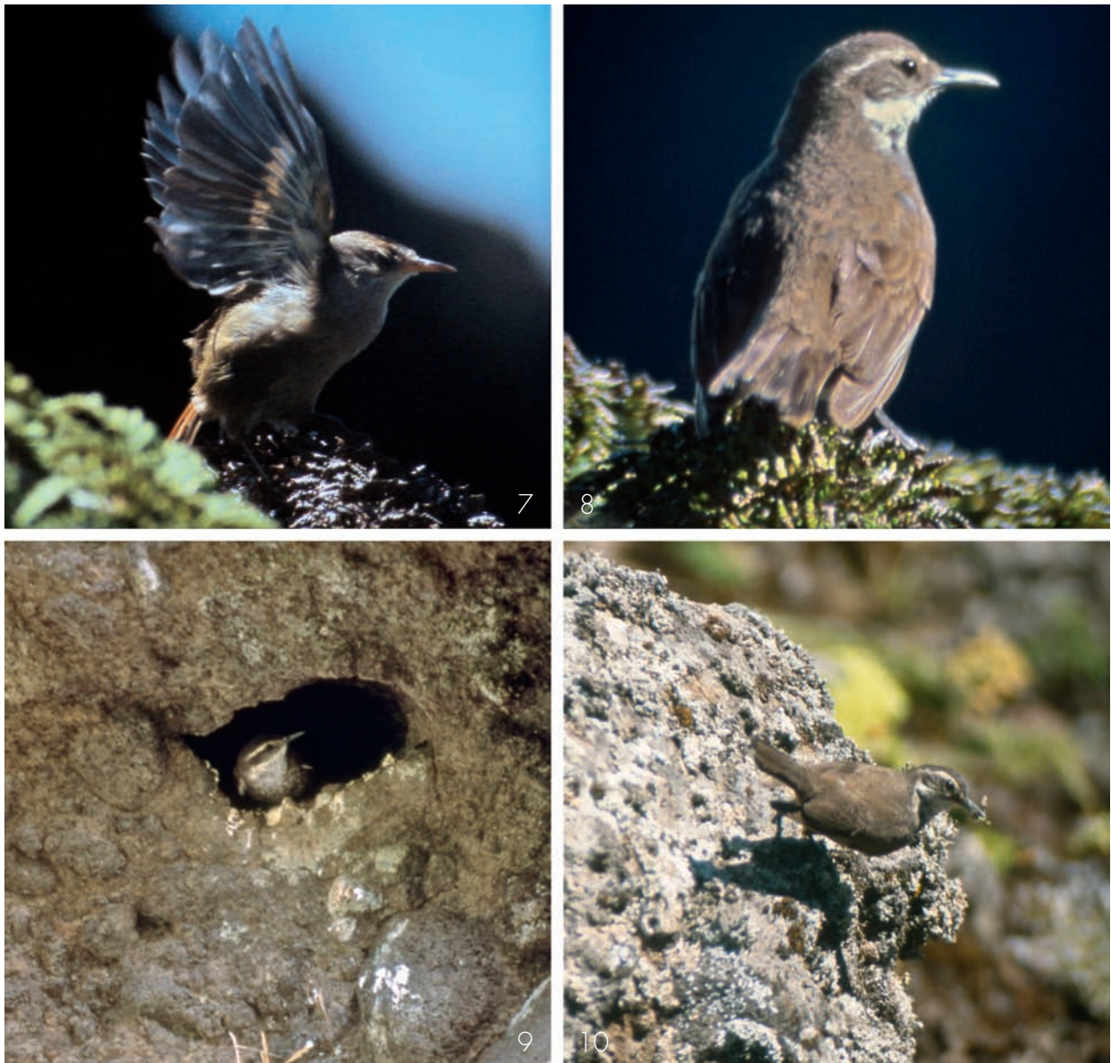
Fig. 7. Foraging adult Másafuera Rayadito Aphrastura masafuerae stops shortly on top of a fern frond to search for arthropod prey items between the small leaves of a Lophosoria quadripinnata .

Fig. 8. Másafuera Cinclodes Cinclodes oustaleti baekstroemii mostly hunt on flying insects. They are acrobatic and fast flyers, and do not depend on the shelter of a vegetation cover to escape hawks. Mostly frequenting open and rocky habitats, they are rarely seen on ferns like here.