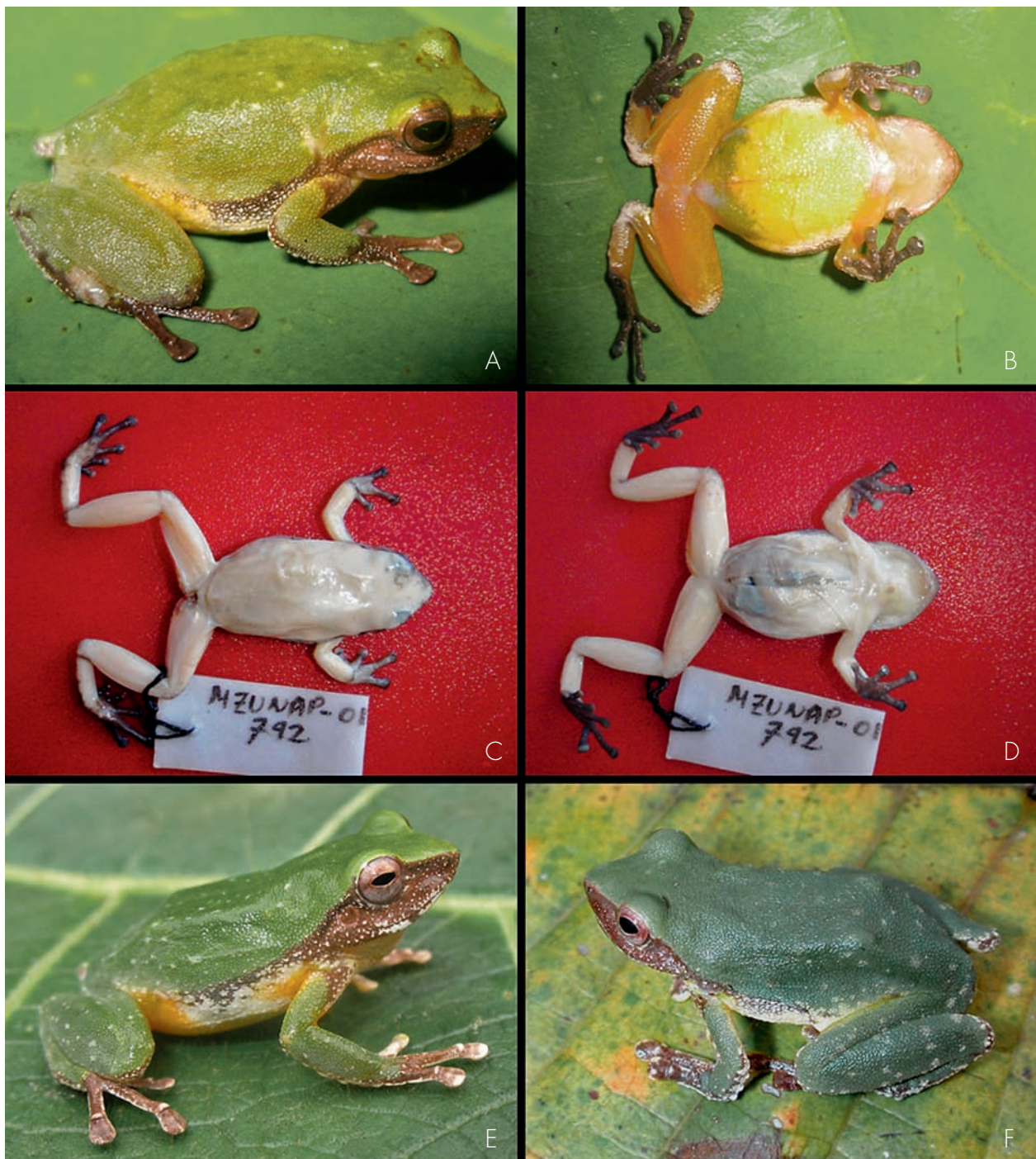
Fig. 1. Holotype of Pristimantis padiali sp. n. (MZUNAP-01-792) in life, (A) dorsal, and (B) ventral views. Holotype of P. padiali sp. n. (MZUNAP-01-792) in alcohol, (C) dorsal, and (D) ventral views. Referred adult specimens of P. padiali sp. n. in life, (E) NMP6F 16 from the type locality, and (F) NMP6F 18 from Puerto Almendras (Loreto, Peru).

FMNH 109829; San Jacinto, KU 221995 . San Martín: río Cainarachi, 33 km NE Tarapoto, on road to Yurimaguas, KU 209466 ; río Shilcayo, Tarapoto, KU 209467 ; 15.4 km SW Zapatero, KU 217308-10 .