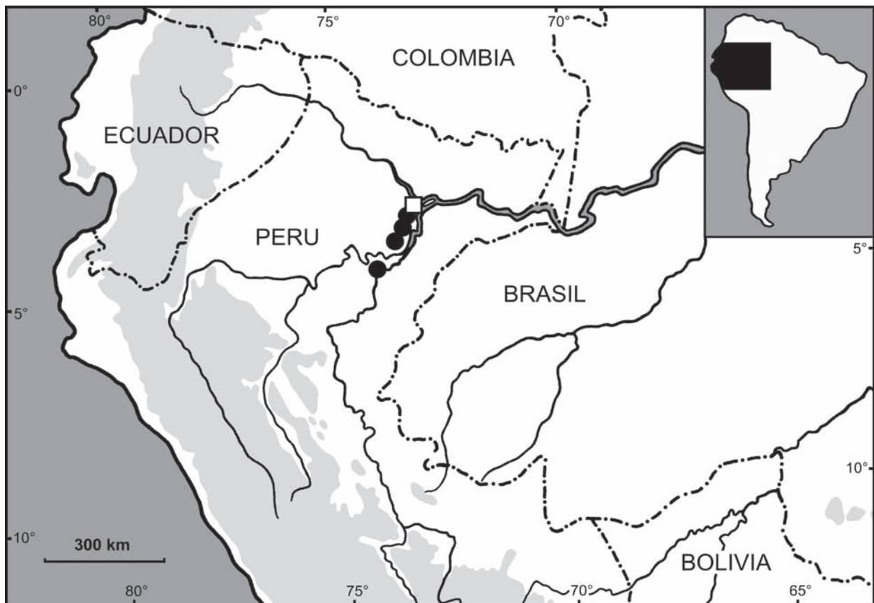
Fig. 4. Schematic map of northern and central Peru showing the known distribution of Pristimantis padiali sp. n. Square indicates the type locality. Shaded areas indicate elevations above 500 m a.s.l.

length 13.6, 10.6; foot length 11.3, 8.9; head length 8.8, 7.0; head width 9.0, 7.5; eye diameter 3.3, 2.8; tympanum diameter 1.3, 1.0; interorbital distance 4.2, 3.4; upper eyelid width 1.8, 1.7; internarial distance 2.3, 1.8; eye-nostril distance 2.6, 2.2. General coloration of paratypes is similar to that of the holotype; the white dorsal spots are more conspicuous and denser posteriorly. Adult male differs in dense dorsal pigmentation of snout (up to interorbital area), pigmented throat and more intensively pigmented flanks, upper arms and knees. Both paratypes have less dense pigmentation of palmar and plantar surfaces. Juvenile (NMP6F 25–26) and subadult (NMP6F 22–23) specimens differ in round to truncate snout dorsally, denser white spotting, light-green to greenish-brown iris, yellow-green throat and ventral surfaces of limbs including hands and feet, and absence of conspicuous dark pattern on loreal-tympanic region and flanks.