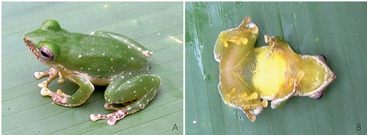
Fig. 3. Holotype of Pristimantis tantanti (MUSM 23942) in lateral (A) and ventral (B) views.

tus ), acuminate snout (rounded), dark loreal-tympanic region (yellow tan canthal stripe), absence of vocal slits (present), presence of discoidal fold (absent), and by presence of dark brown palmar and plantar surfaces in adults (cream to yellow) (LYNCH, 1980; material examined); from P. tantanti (Fig. 3) by larger size (SVL up to 21.9 in males and 29.9 in females in P. tantanti ), snout acuminate in dorsal view (acuminate-triangular), presence of tympanic annulus (absent), presence of tympanic membrane (absent), presence of discoidal fold (absent), absence of ulnar and tarsal folds (present, prominent, see LEHR et al. , 2007: Fig 2, p. 96), fingers with basal lateral fringes (lateral fringes broad, not restricted basally; outer fringe of Finger IV continuing to proximal edge of palm with its shape slightly undulated), toes without lateral fringes (broad lateral fringes present, outer fringe of Toe V contacting outer row of fold of plantar surface with its shape undulated) and without webbing (basal webbing present) and by dark brown palmar and plantar surfaces in adults (yellow to yellowish brown) (LEHR et al. , 2007; LEHR, 2009; material examined).