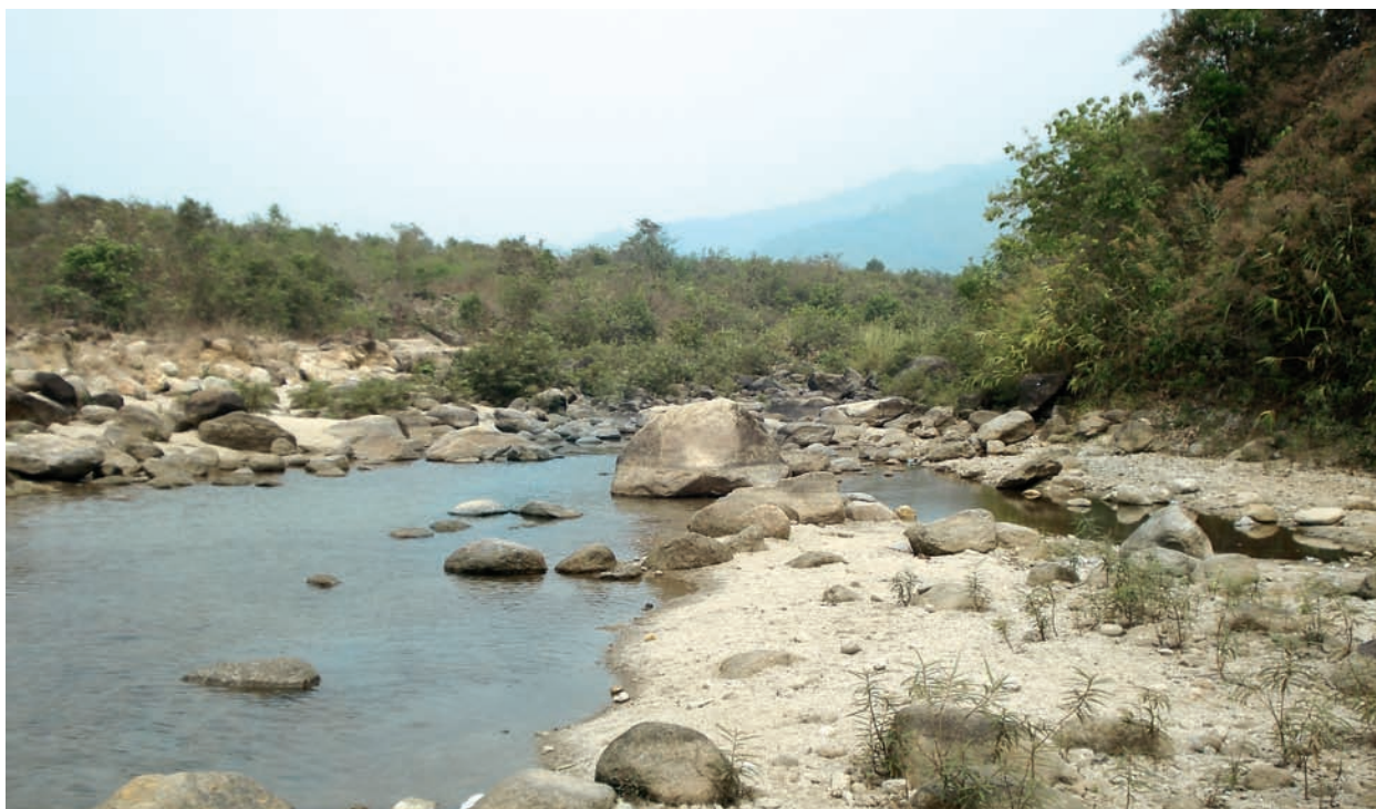
Fig. 7. Habitat (type locality) of Badis juergenschmidti sp. n.

Before the comprehensive revision of Badidae by KULLANDER & BRITZ (2002) was published, only 3 different species were recognized as valid within Badis . The revision revealed the large diversity of this genus. As pointed out and discussed by REIS (2004) such revisions are not only an inventory of the current knowledge, but also provide an important source for the discovery and description of additional species in subsequent studies. The herein described species, B. juergenschmidti , lifts the number of species taxa in the genus to 15. This, however, does not complete the picture of species richness in the genus Badis . We know of several forms which seem to be distinct from hitherto described species. These are often well-known both in the aquarium hobby and popular literature (see VAN DER VOORT, 2009), but lack of sufficient material prevents their formal description.