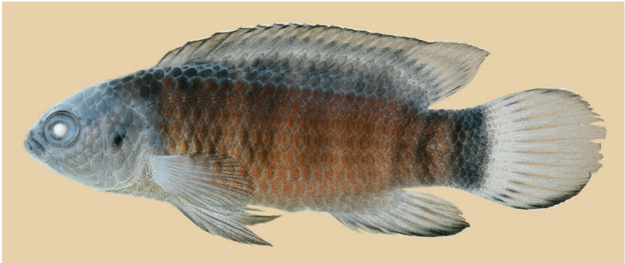
Fig. 2. Badis juergenschmidti sp. n., holotype, male, MTD F 32325.