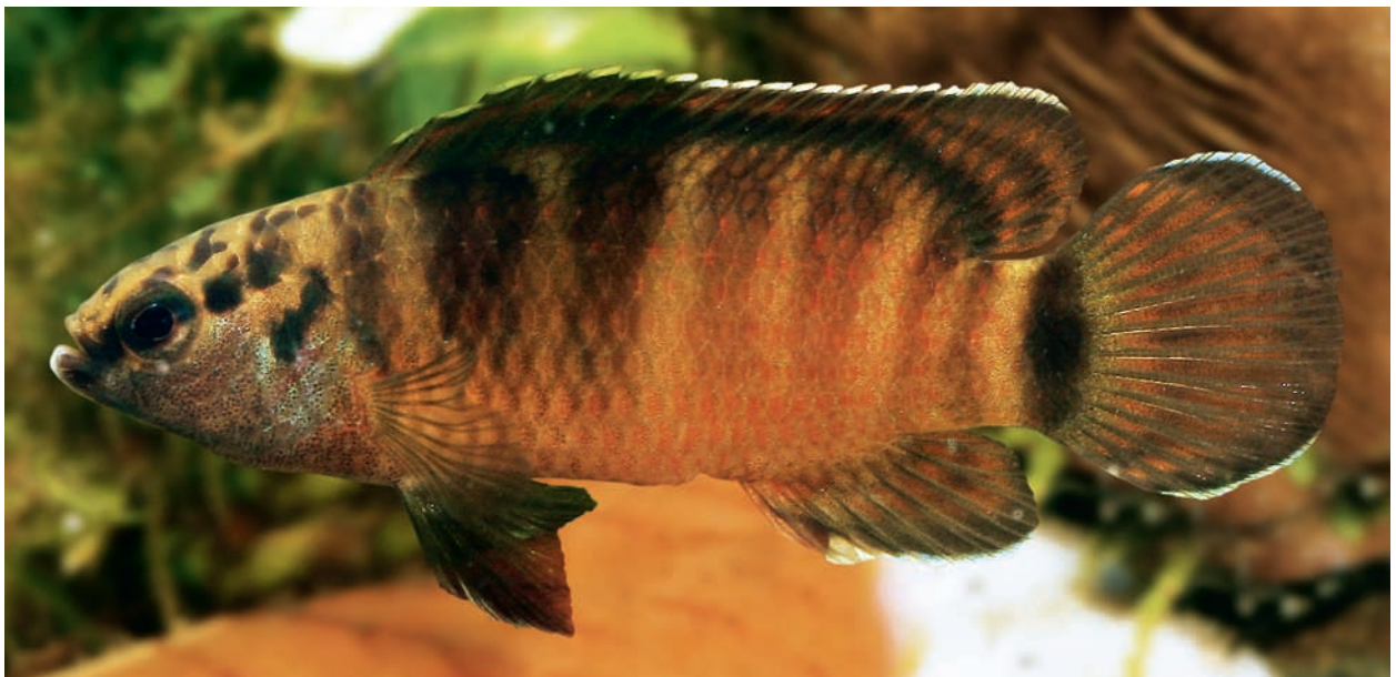
Fig. 5. Colouration in life of Badis juergenschmidti sp. n. (male) showing bar pattern.

B. kanabos , B. ferrarisi , B. corycaeus , B. dibruensis , B. tuivaiei and B. pyema ), bar 1 not curved (versus curved in B. kyar ). It can furthermore be differentiated by the absence of a conspicuous blotch on the posterodorsal corner of the opercle (versus present in B. assamensis and B. blosyrus ), no reduced number of lacrymal and dental pores (dental pores 3 and lacrymal pores 3 versus lacrymal pores 2 and dental pores 1–2 in B. corycaeus and B. pyema ), presence of white margins on dorsal and ventral parts of caudal fin in males (versus no such pattern in B. kanabos , B. badis , B. chittagongis , B. siamensis , B. dibruensis , B. tuivaiei ,