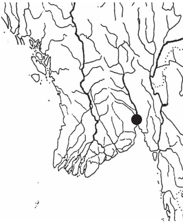
Fig. 6. Collecting site of Badis juergenschmidti sp. n. in Myanmar.

The species of Badis are easily separated from species of the genus Dario by the presence of tube-bearing scales in the lateral line (versus absence of bony tubes in Dario ) and a shorter pelvic fin in males (pelvic fin not reaching beyond the anterior base of anal fin versus pelvic fin in males reaching beyond the anterior part of anal fin in Dario ). Following these character sets B. juergenschmidti fits the genus Badis .