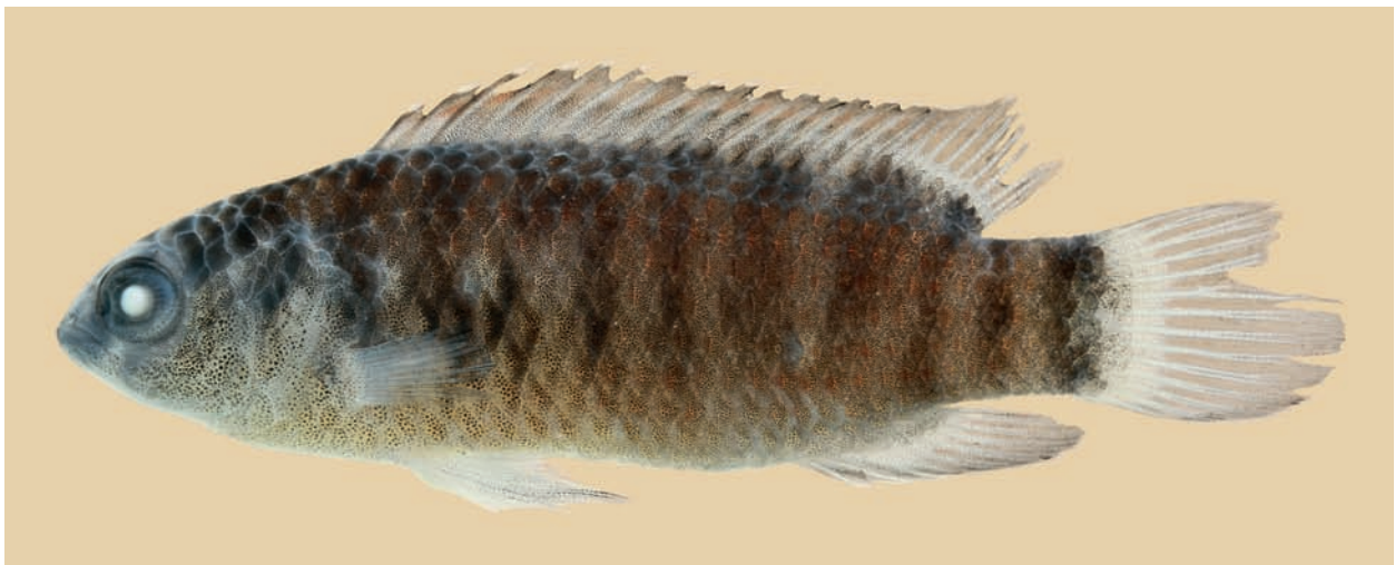
Fig. 3. Badis juergenschmidti sp. n., paratype, female, MTD F 32326.

anterior half of head and midaxis of body. Predorsal contour concave arched, in smaller specimens more straight; prepelvic straight, slightly concave. Dorsal-fin base almost straight. Caudal peduncle with straight dorsal and ventral edge, longer than deep (caudal peduncle length/caudal peduncle depth \approx 0.75 ). Females smaller than males (largest measured female specimen is 30.3 mm SL versus 34.6 mm SL). Dentary pores 3, lacrymal pores 3. Predorsal scale 3–4 anterior to coronalis pore, 7–8 posteriorly. Scales in vertical row 1\frac{1}{2} above and 7 below lateral line. Scales in lateral row 26(2) or 27(3). Tubed scales in lateral line 21\frac{1}{4} (3), 22\frac{1}{4} (1) or 22\frac{1}{5} (1). Dorsal fin base densely scaled with 1–2 scale rows, anal fin base scaled with 2 rows. Caudal-fin base scaled. Soft dorsal and anal fin rounded, reaching slightly beyond caudal fin base. Caudal fin (length 28–32 % of SL) round or subtruncate in adult