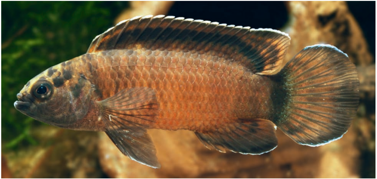
Fig. 4. Colouration in life of Badis juergenschmidti sp. n. (male) with reduced bar pattern.