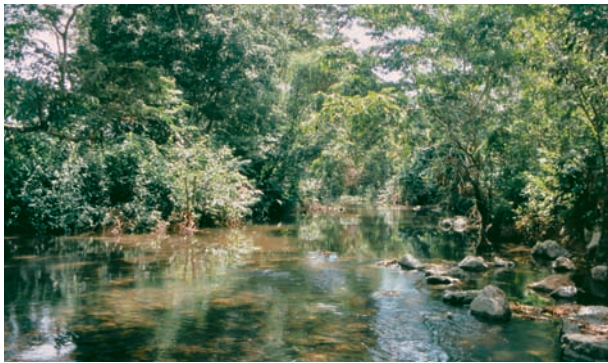
Fig. 5. Habitat: rio Mizola, above Cascada Misol-Ha, type locality of P. lacandonae .

distance values between P. lacandonae and the most closely related species, P. compressa and P. chamulae are even higher than corresponding values for the well recognized species of Southern swordtails. The genetic distance between one individual of P. lacandonae collected above the waterfall and one below the waterfall was zero.