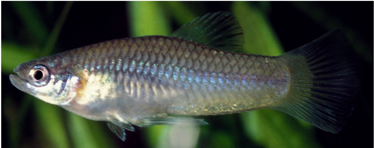
Fig. 3. Priapella lacandonae ; Mexico: Cascada Misol-Ha, aquarium specimen, male.