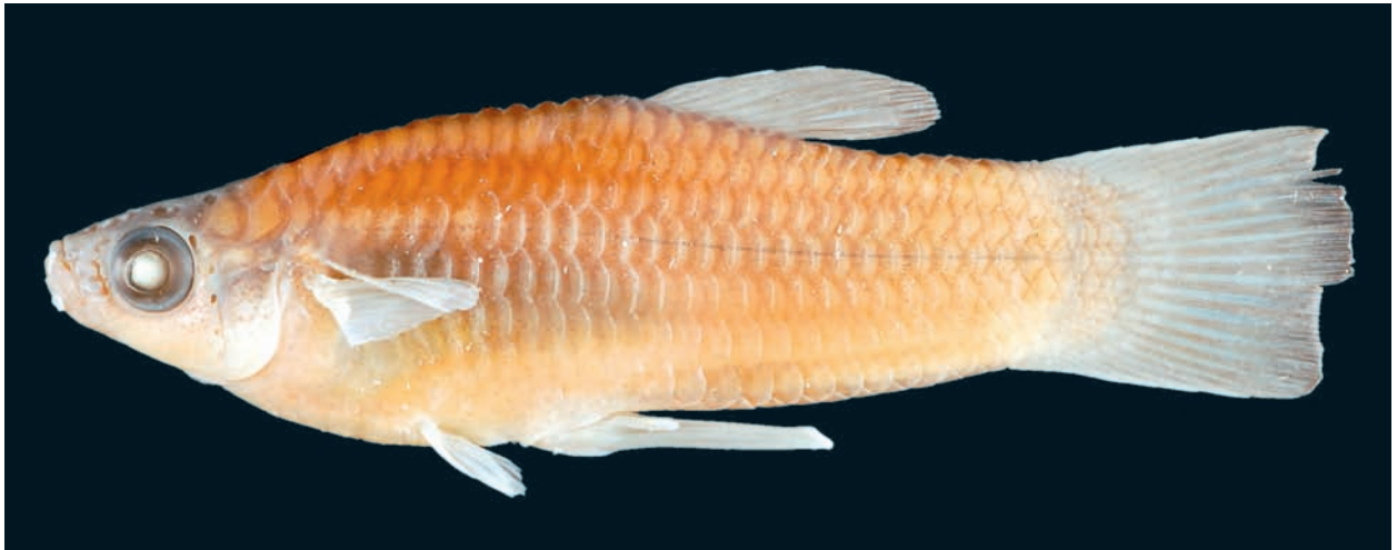
Fig. 1. Priapella lacandonae ; Mexico: río Mizola 20 km S Palenque, holotype, MTD F 32298, male, 32.6 mm SL.