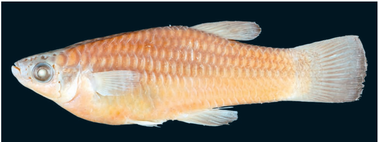
Fig. 2. Priapella lacandonae ; Mexico: río Mizola 20 km S Palenque, paratype, MTD F 32299, female, 49.1 mm SL.