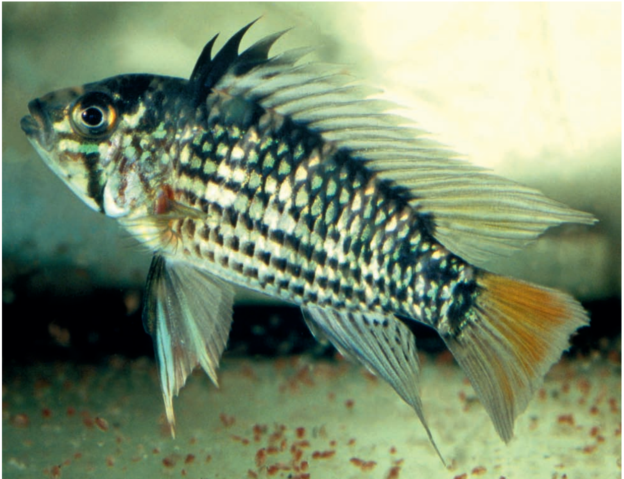
Fig. 3. Apistogramma playayacu sp. n., non type, male, live coloration in the aquarium, adult subdominant, aggressive.

subadult to semi-adult individuals, broad, width of interspaces approximately 10 % of bar width. No distinct dorsal spots, but slightly brownish stripe covering only uppermost scale row immediately below dorsal base. Spot on caudal peduncle visible in all specimens, basically upright oval, divided horizontally in most males, entire in females and some small males. Under microscope caudal fin with small light greyish to pale brownish spots, giving cloudy milky to greyish impression; in males basal quarter to third of fin with irregular pattern of blackish brown vertical streaks or spots; no spots or other markings in females; rest of fin without any pattern in all specimens. Base colour of all other fins likewise cloudy milky to pale grey but light brownish in some larger males. Dorsal fin with dark blackish-brown spots on base of every second and third membrane, covering about one tenth of height of fin; first membrane in males, first and second (rarely third) in females, dark brown to black; in males irregular series of dark brown spots or dashes covering spines along centre of fin, streaks extending to tips of spines in some cases. Soft portion of dorsal and anal fins without hyaline spots of