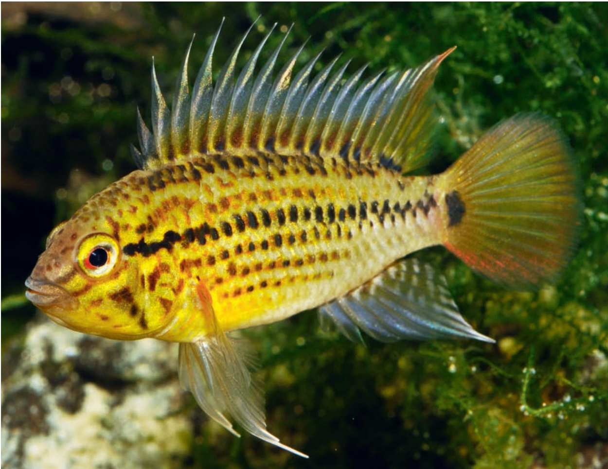
Fig. 6. For comparison: Apistogramma guttata , male, not preserved, live coloration in the aquarium, territorial, dominant, aggressive.

this question are as yet lacking. Further study is required, and should focus on variation in live coloration, behaviour, and ecological background data.