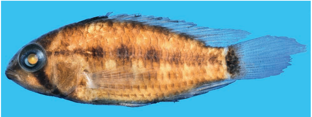
Fig. 2. Apistogramma playayacu sp. n., paratype, FMNH 117727, female, 30.2 mm SL; 29 years after preservation.

San Miguel, December 2006, coll. M. SUGINO; further material as listed in RÖMER (1994, 1997, 2006), RÖMER & HAHN (2008, in prep.), RÖMER & WARZEL (1997), and RÖMER et al. (2003, 2004, 2006a-c, 2011).