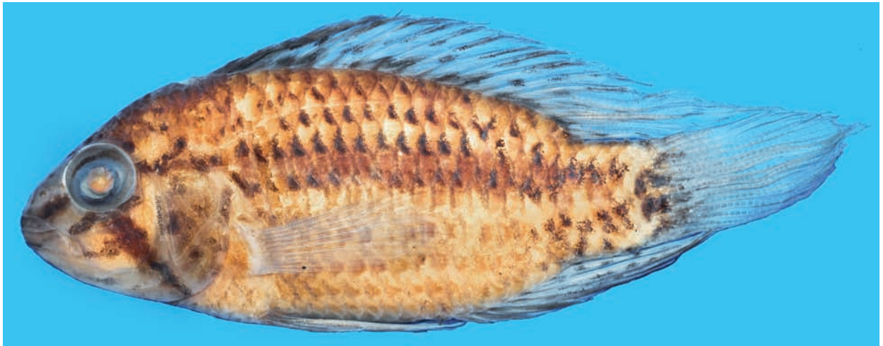
Fig. 1. Apistogramma playayacu sp. n., holotype, FMNH 101589, male, 45.8 mm SL; 29 years after preservation.