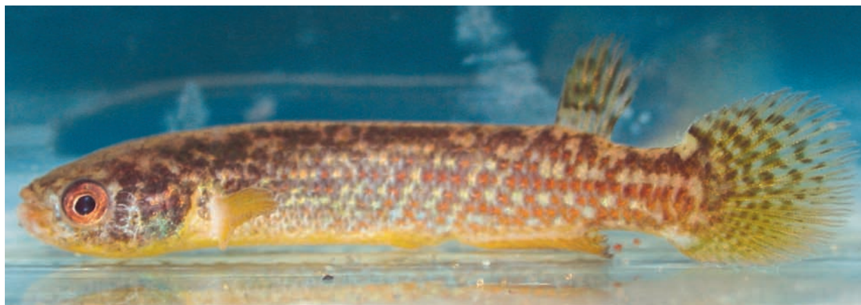
Fig. 2. Rivulus parlettei , female Peru, río Araza drainage.

Colouration. Body sides of males (Fig. 1) metallic green-yellow, dorsolateral portion of body between postorbital region and anterior portion of flank pale brownish with dark brown mottling; broad interrupted lines comprised of red dots on entire flank. Dorsum brownish. Venter light blue. Opercular region green-yellow. Ventral part of head light blue. Upper jaw light brown, lower jaw dark brown. Iris yellow. Dorsal fin pale yellowish with a transverse red stripe and short oblique red bars on posterior portion. Anal fin pale yellowish, base whitish with red spots on posterior portion. Caudal fin pale yellowish to hyaline on posterior margin and with red spots on proximal portion. Pelvic fins yellowish. Pectoral fins yellowish to hyaline. Body sides of females (Fig. 2) light yellow, with irregular dark brown mottling and orange spots and oblique marks of variable shape, forming three irregular lines on caudal peduncle. Dorsum brownish. Venter orange yellow. Opercular region with large dark brown blotch. Ventral part of head yellow. Upper jaw light brown; lower jaw yellow. Iris yellow. Dorsal fin hyaline to pale yellow-