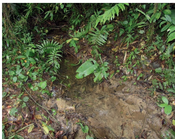
Fig. 4. Habitat (type locality) of Rivulus parlettei .