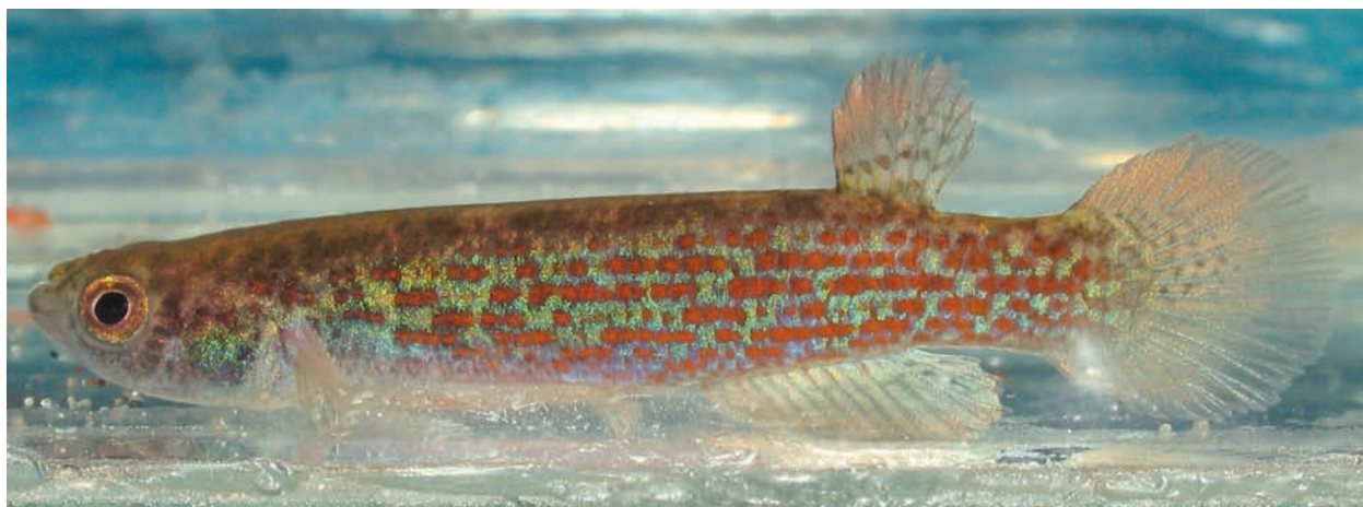
Fig. 1. Rivulus parlettei , MUSM 39906, male, holotype, 37.7 mm SL, Peru, río Araza drainage.