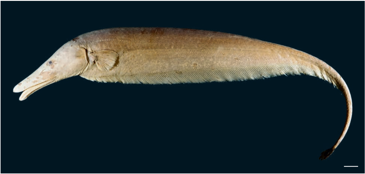
Fig. 1. Apteronotus acidops , holotype, lateral view, MZUSP 45685, 321 mm LEA, rio Paraná, Brazil. Scale bar = 1 cm.