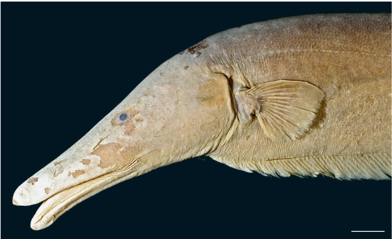
Fig. 2. Apteronotus acidops , holotype, lateral view of head, MZUSP 45685, 321 mm LEA, rio Paraná, Brazil. Scale bar = 1 cm.

spatially. Dentary with two series of elongated teeth, backward directed. Anterior nostril tubular, distant from anterior extremity of snout about two eye diameters, and from nearest upper lip margin about a little more than two eye diameters; antero-dorsally with one lateral line pore and postero-dorsally with another one; distant from posterior nostril about a little less (small specimens) or a little more (largest specimens)