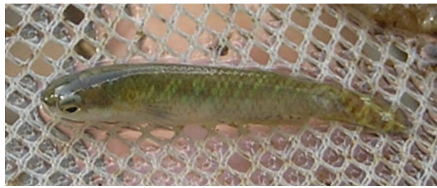
Fig. 2. Rivulus albae , male just collected from Tartaruga Grande drainage.

per under a dissecting microscope and rounded to the nearest 0.1 mm.