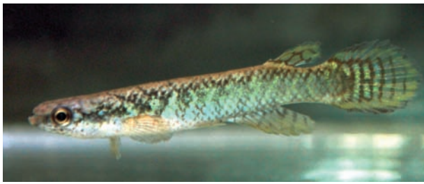
Fig. 1. Rivulus albae , adult male from the type locality.