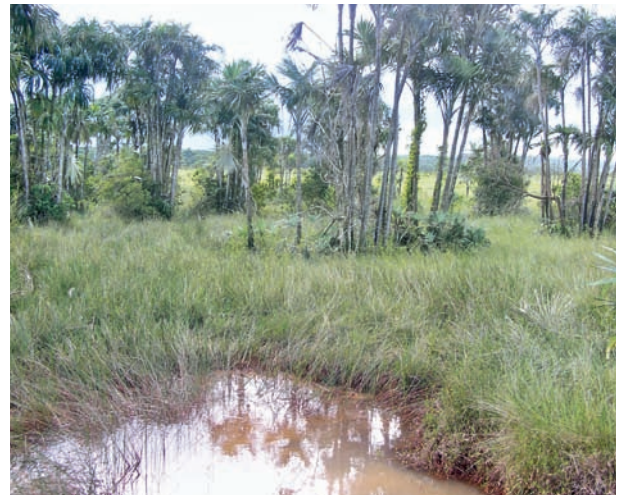
Fig. 4. Rivulus albae , type locality: Brazil: Amapa: Lago Comprido floodplains, Pozo Bacabae.

Anal fin pale yellow, base whitish to light blue, with 4 oblique brownish bars. Caudal fin pale yellow to greenish with 5 to 6 narrow brownish to red bars crossing fin except on dorsal and ventral portion, margin dark grey to black. Pectoral fin yellowish to