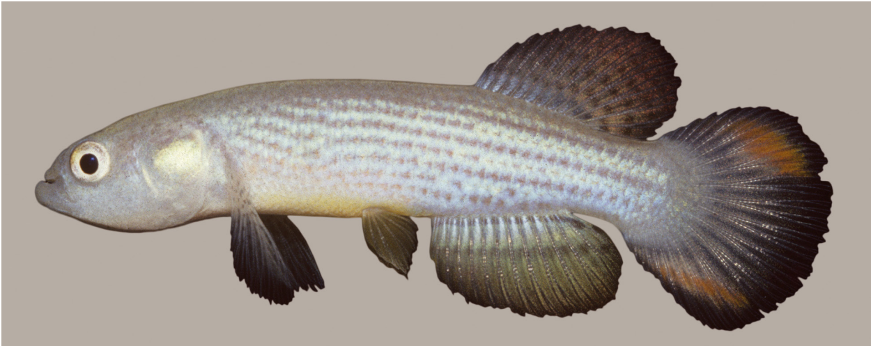
Fig. 5. Neofundulus paraguayensis , UFRJ 2113, male, 46.8 mm SL: Brazil: Mato Grosso do Sul: Porto Murtinho.