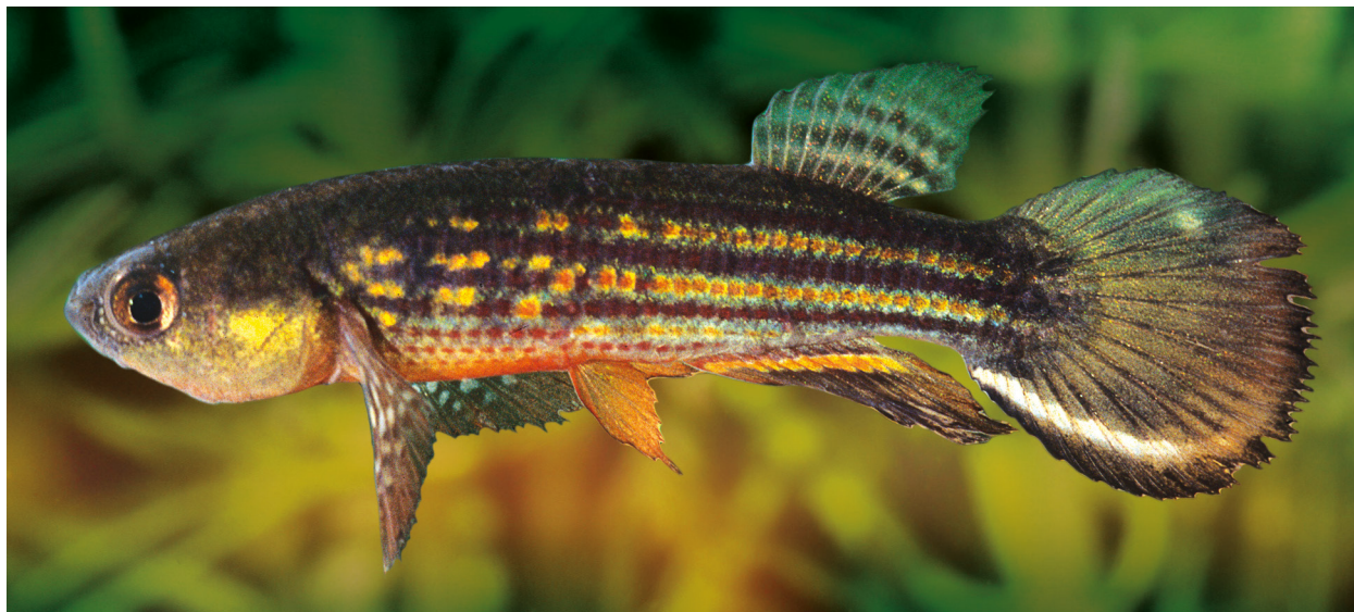
Fig. 1. Neofundulus parvipinnis : UFRJ 4886, male, 33.6 mm SL: Brazil: Mato Grosso: Joselândia.