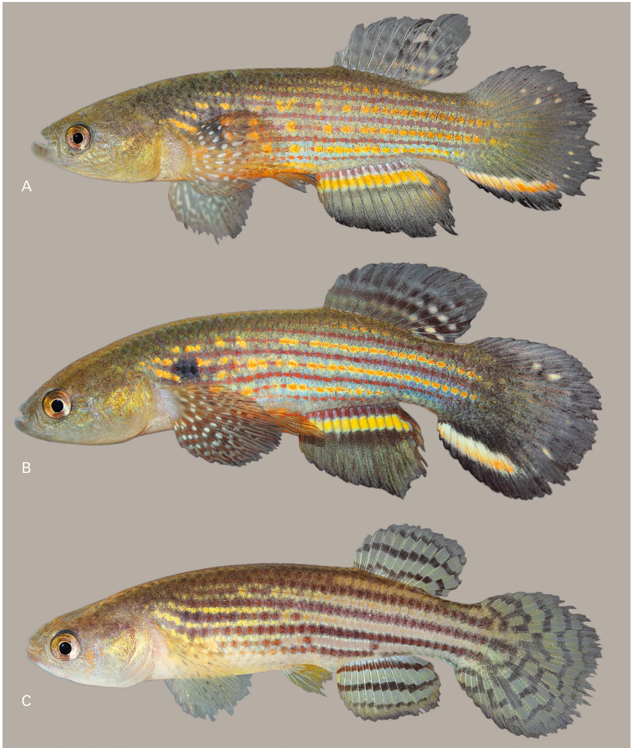
Fig. 4. Neofundulus aureomaculatus : A, UFRJ 10087, holotype, male, 46.6 mm SL; B, UFRJ 10088, paratype, male, 41.2 mm SL; C, UFRJ 10088, paratype, female, 38.9 mm SL; Brazil: Mato Grosso do Sul: Aquidauana.

vs. 17.4–19.4 % in N. parvipinnis and 16.1–20.6 % in N. rubrofasciatus ); from N. splendidus by having 34–36 scales on the longitudinal series (vs. 40–41) and absence of black bars on the dorsal fin in males (vs. presence); from N. parvipinnis by having dorsal-fin base larger and dorsal fin slightly more anteriorly positioned in males (dorsal-fin base length 17.5–20.9 % SL,