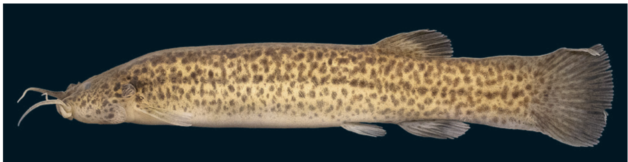
Fig. 1. Trichomycterus giarettai , UFRJ 10109, preserved holotype, 69.4 mm SL; Brazil: Goiás: Município de Cumari.