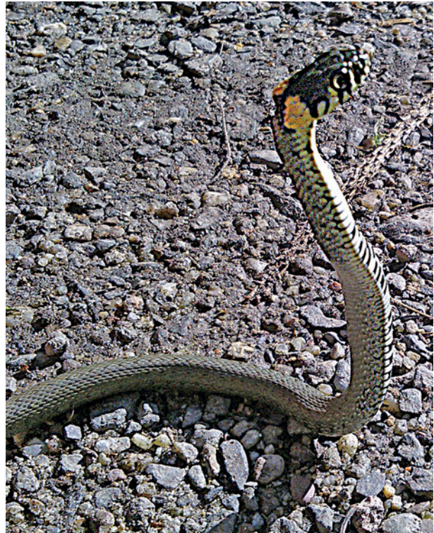
Fig. 2. Cobra stance displayed by a grass snake ( Natrix natrix ). Photo by Carolin Kindler, 27 August 2014, Dresdener Heide, Dresden-Klotzsche, Saxony, Germany.

The simulation of a cobra hood is displayed by a number of non-venomous or weakly venomous snake species that – except for Hydrodynastes gigas , Ninia atrata , and Heterodon spp. – occur at least in partial sympatry with cobras: Rhagerhis moilensis (MERTENS, 1946; LEÓN et al. , 2013; WERNER, 2016), a Western Palearctic species known as the ‘false cobra’ and distributed in northern Africa and the Middle East; Pseudoxenodon macrops , the so-called Chinese false cobra from Asia, and its Asian congener P. bambusicola (POPE, 1935; MERTENS, 1946; WHITAKER & CAPTAIN, 2004); Amphiesma stolatum of Asia (GHARPUREY, 1954); Lytorhynchus diadema of North Africa and the Near East (WERNER, 2016); and Plagiopholis nuchalis of Southeast Asia (CHAN-ARD et al. , 2015). In addition to these taxa, similar behaviors have also been described for Macropisthodon spp. (Asia), Heterodon spp. (North America), Hydrodynastes gigas