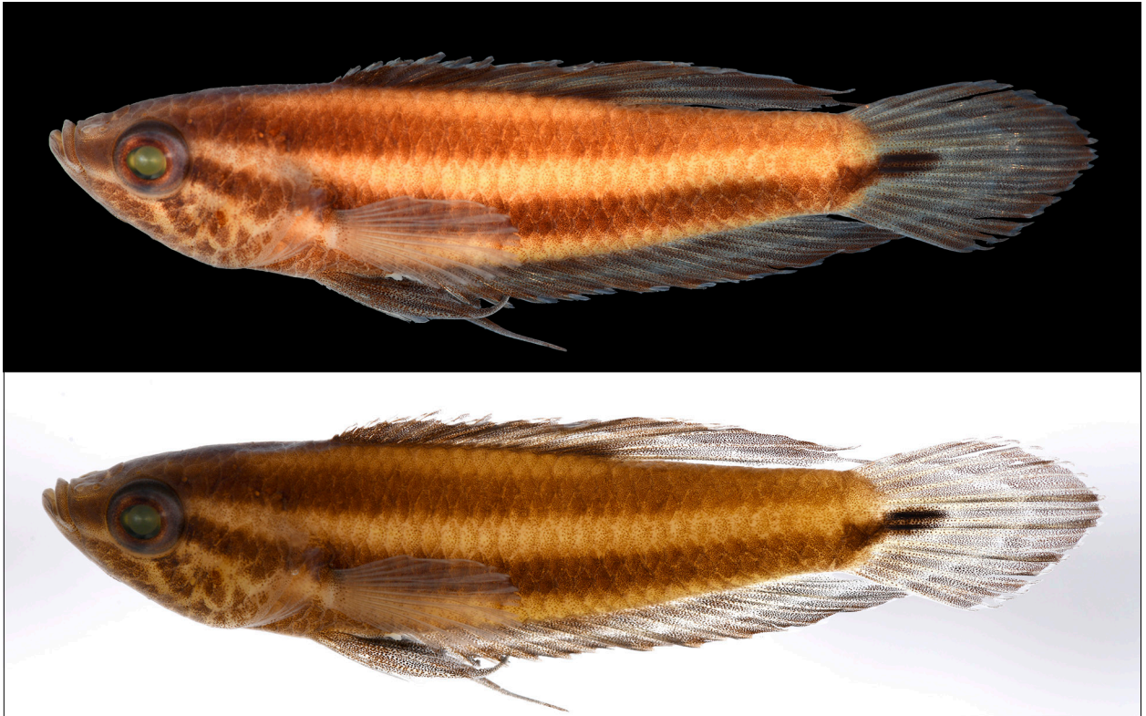
Fig. 1. Parosphromenus barbarae , ZRC 61243, 24.5 mm SL male holotype, photographed on black (top) or white (bottom) background.