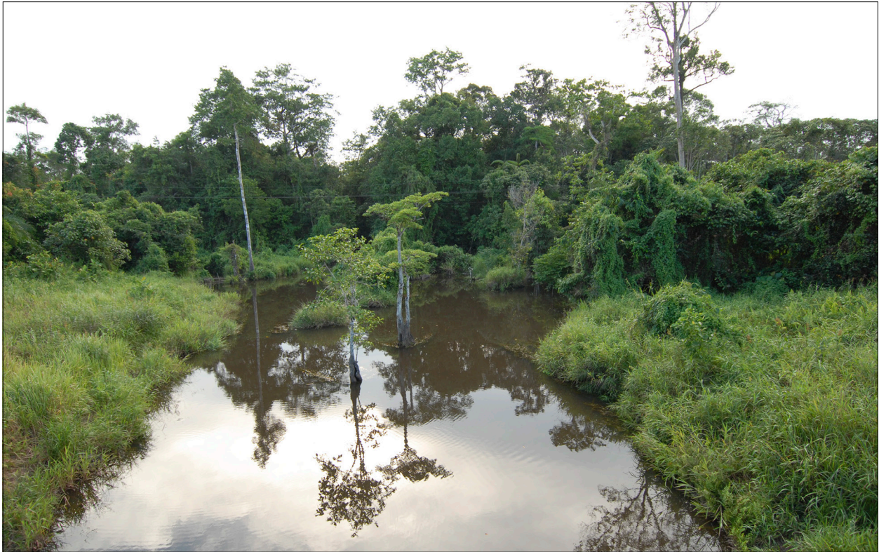
Fig. 6. Photograph of type locality habitat, July 2007.

tion of the Pan Borneo Highway and no longer support the above recorded species composition (second author, pers. obs.; Shi W., pers. comm.).