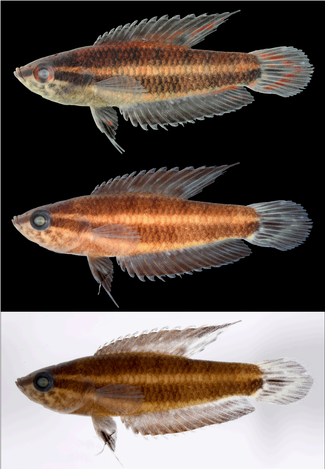
Fig. 5. Parosphromenus allani , ZRC 61241, 29.0 mm SL male, Sarawak: Sibü, photographed in 2008 (top) and 2020 (middle) on black and on white background (bottom).