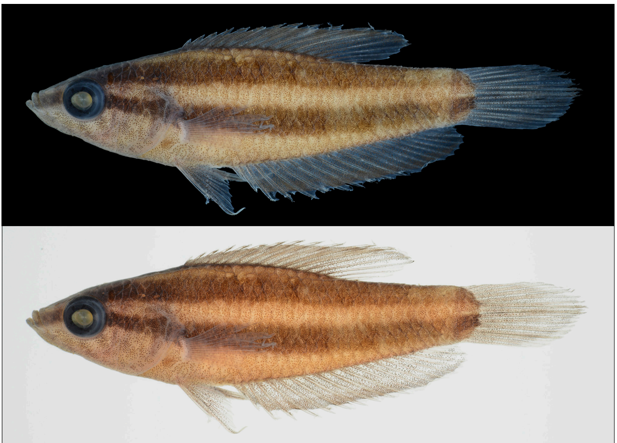
Fig. 2. Parosphromenus barbarae , NMBE 1078329, 24.0 mm SL female paratype, photographed on black (top) or white (bottom) background.