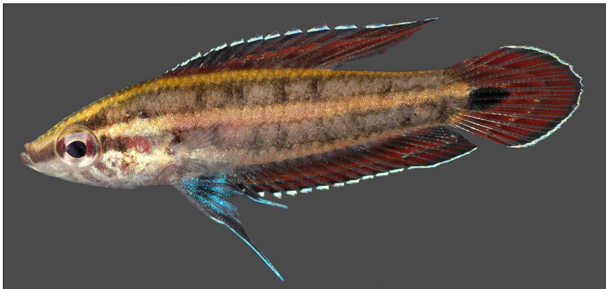
Fig. 3. Parosphromenus barbarae , ZRC 61245, ca. 25.0 mm SL male paratype (when live; right-side reversed).

orbital area with grey pigments, forming into two broken oblique streaks to opercle area. Belly silvery gold. Dorsal fin reddish, with mid section brighter red, bright blue margin, indistinct darker red ocellus on posterior basal area. Caudal fin reddish, bright blue margin, subdistal black band with a second grey band around mid-section; distinct black ocellus at base of caudal fin. Anal fin reddish, with basal area dark grey, thin black stripe along mid-section, bright blue margin. Pelvic fins with bright blue iridescence, with two dark grey bands, one at base of filamentous ray, another at mid-section. Pectoral fin hyaline.