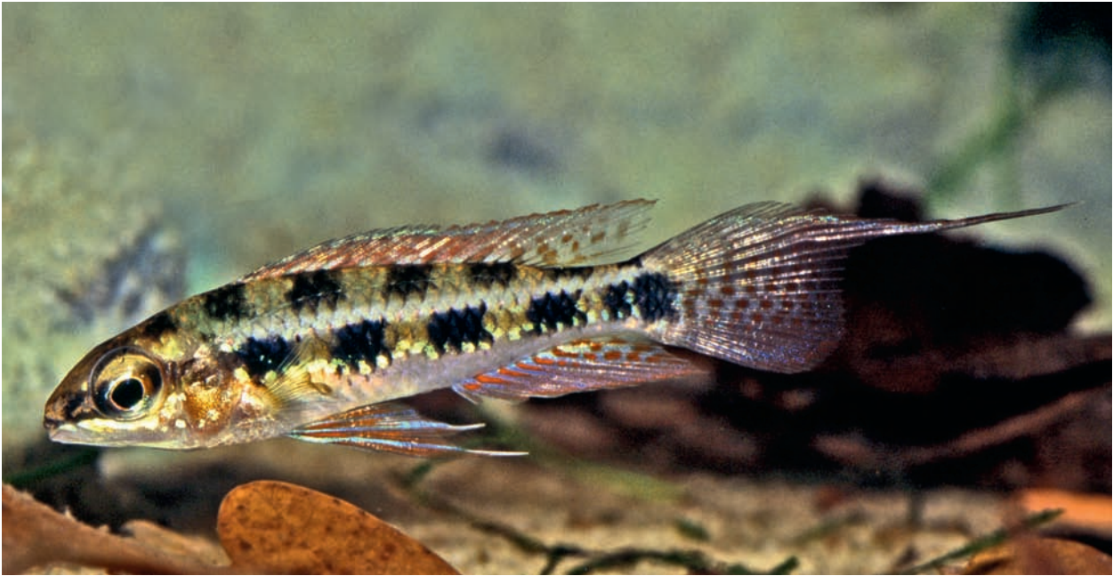
Fig. 2. Live adult male of Dicrossus gladicauda sp. n., photographed in aquarium.