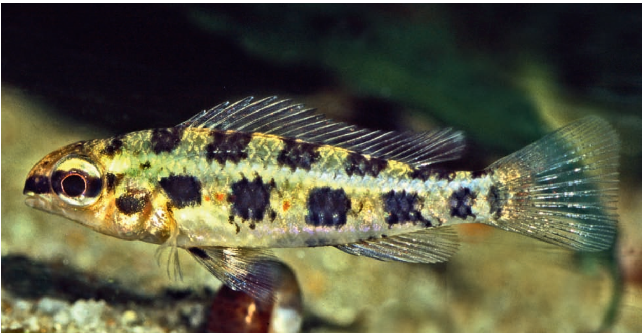
Fig. 3. Live topotypic adult female of Dicrossus gladicauda sp. n., photographed in aquarium.

(left/right) teeth along entire arm. Lower jaw long and comparatively low (anguloarticular depth about 52% of length). Coulters wider than deep, without bony mandibular canal. Anterior teeth on dentary procumbent; outer hemiseries with 19/22 teeth along entire arm. Lower pharyngeal tooth plate triangular in dorsal aspect (width/length \approx 1.2 ), with 12 teeth in posterior row and 14 in median row. Anterior teeth pointed, unicuspid, rather scattered. Posterior inner teeth regularly arranged; a few of the innermost teeth laterally compressed and bicuspid. First caretobranchial with 4 or 5 ( n=4 ) external gill rakers.