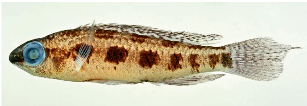
Fig. 1. Dicrossus gladicauda sp. n., holotype, ten weeks after fixation, MTD F 31312.

STEINDACHNER, 1875 and Dicrossus filamentosus (LADIGES, 1958), redescribed by KULLANDER in 1978. Both are dwarf cichlids (max. SL approx. 45 mm), which are distributed in the Amazon River basin (rio Negro, rio Tapajós, rio Maués) in Brazil and in the río Orinoco drainages in Venezuela and Colombia (KULLANDER, 1990, 2003). In addition at least three undescribed species have been known for some time (KULLANDER, 1990, STAWIKOWSKI & WERNER, 2004). The purpose of the present paper is to give a formal description of one of these species, which has been known for several years in the aquarium hobby and was provisionally referred to as Dicrossus sp. “Obenschwert” in the aquarium literature (BORK, 2002; STAWIKOWSKI & WERNER, 2004).