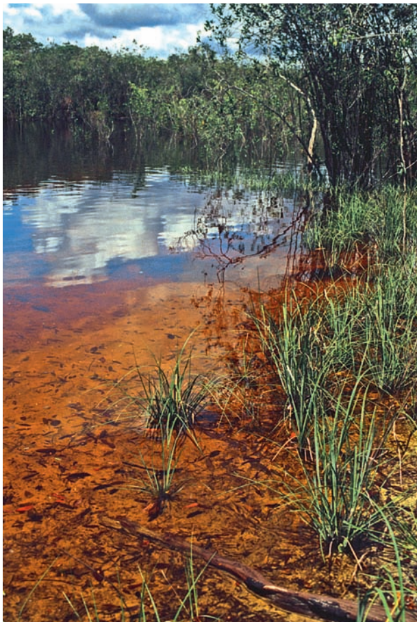
Fig. 5. Type locality of Dicrossus gladicauda sp. n. at the Caño Jigua, a western tributary to the lower Río Atabapo.

Dicrossus gladicauda differs from the undescribed Dicrossus sp. “Rio Negro” ( Dicrossus sp. A in KULLANDER, 1990) and Dicrossus sp. “Rio Tapajos” ( Dicrossus sp. B in KULLANDER, 1990) by the shape of the caudal fin in adult males (asymmetrical, upper lobe with streamer versus oval) and the pattern of dark markings on the body sides (squarish or rectangular blotches versus two series of several small double spots in Dicrossus sp. “Rio Negro” and two series of several short lines in Dicrossus sp. “Rio Tapajos”; cf. STAECK & LINKE, 2006; STAWIKOWSKI & WERNER, 2004).