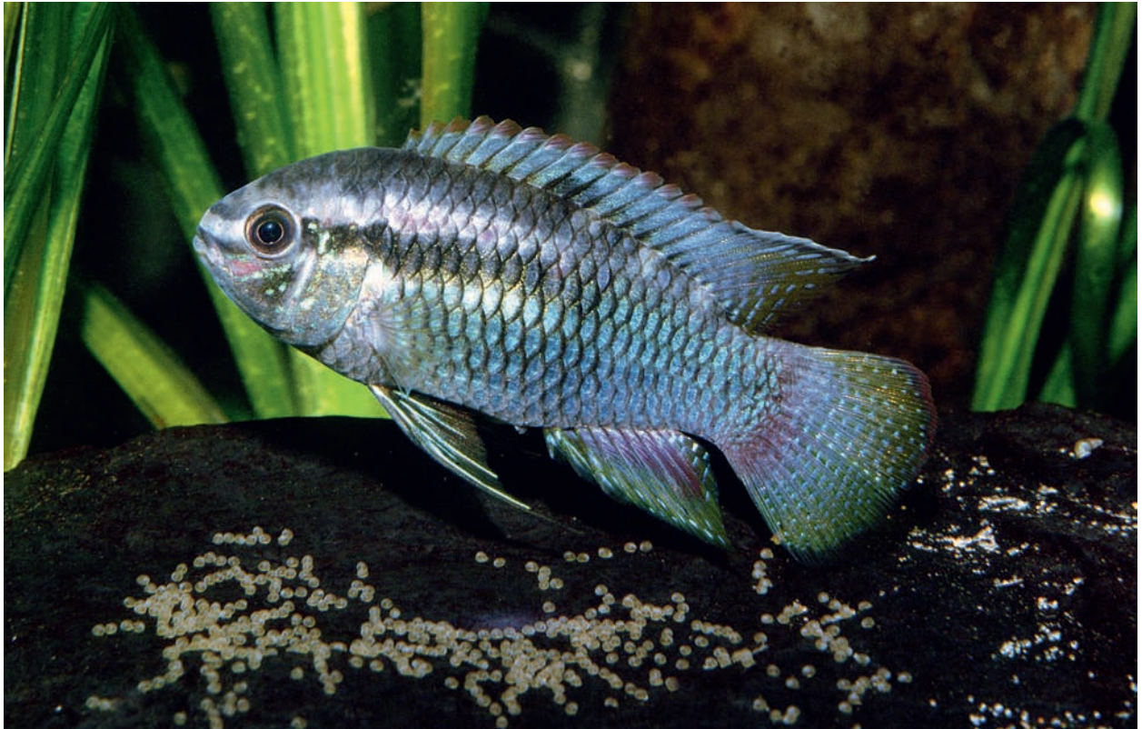
Fig. 1. Laetacara curviceps , live specimen (male) from Santarem, not preserved.