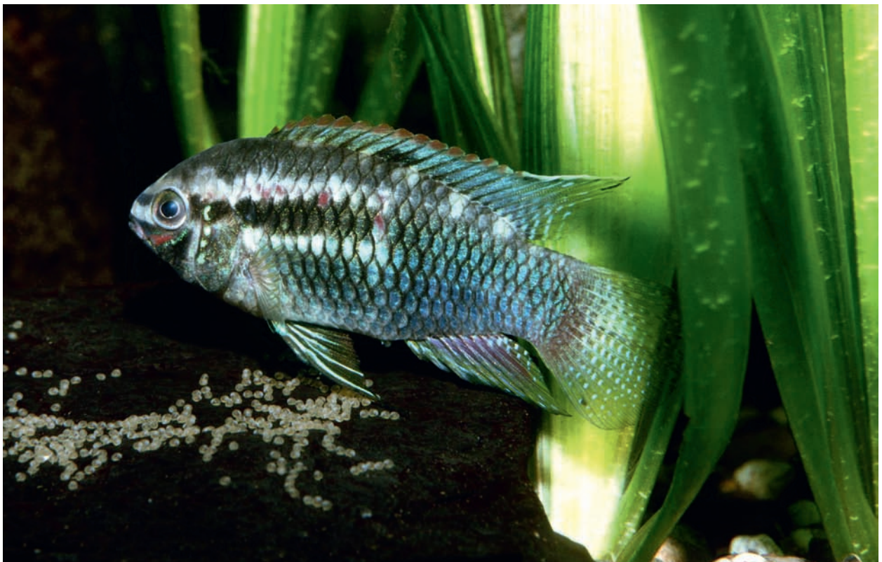
Fig. 2. Laetacara curviceps , live specimen (female) from Santarem, not preserved.

branchial 5 (19–20 vs. 21–24) and no conspicuous red belly in breeding specimens (vs. breeding males and females with conspicuous red cheeks, gill covers and belly).