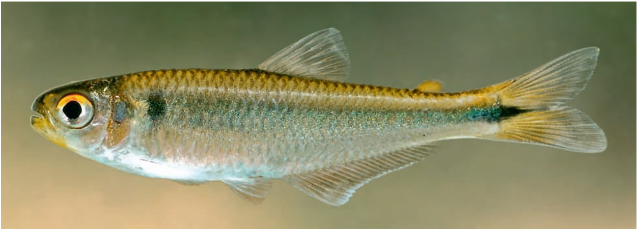
Fig. 4. Bryconamericus guyanensis sp. n., lateral view, not preserved. Tamponc, Maroni, 1998.