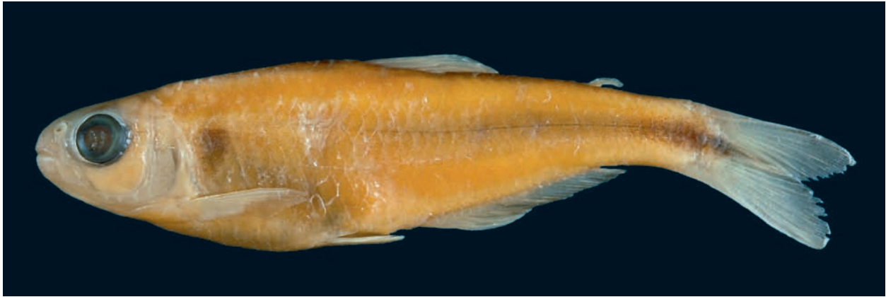
Fig. 1. Bryconamericus guyanensis sp. n., lateral view, 43.2 mm SL, holotype, French Guyana, Mana, crique Eau Claire at 7 km of Saül.