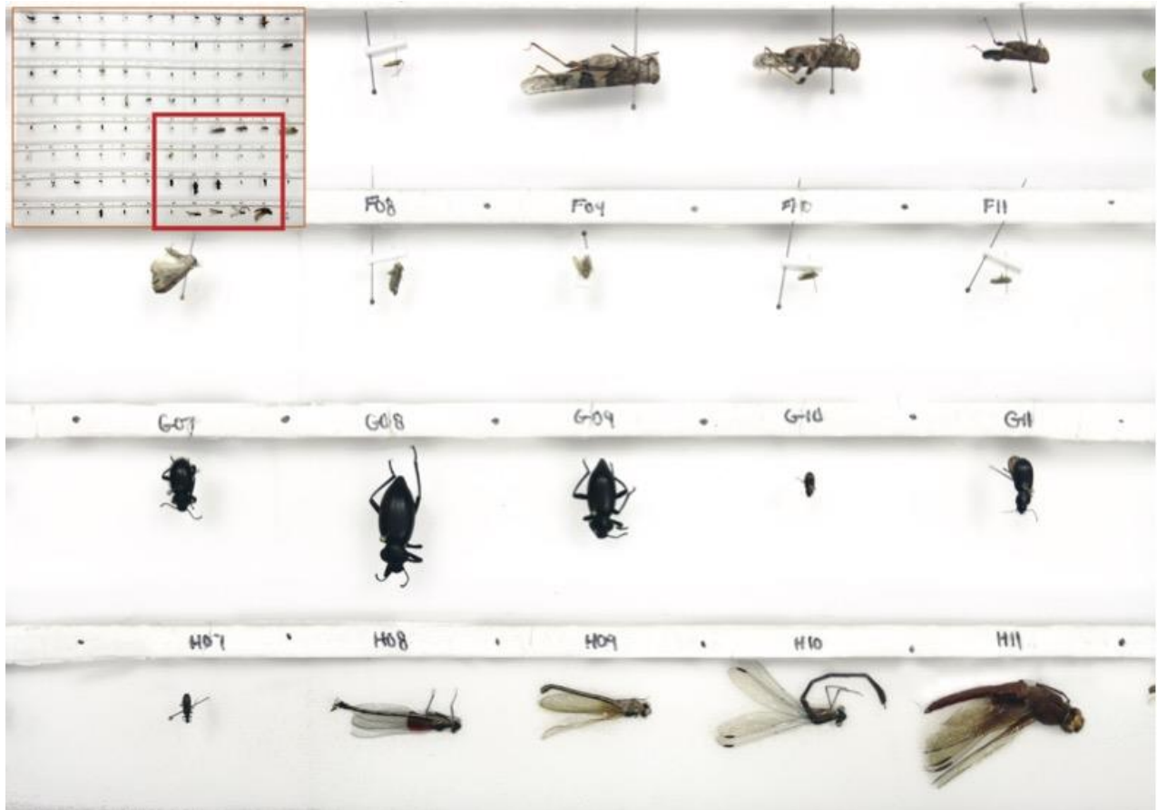
301 Figure 2