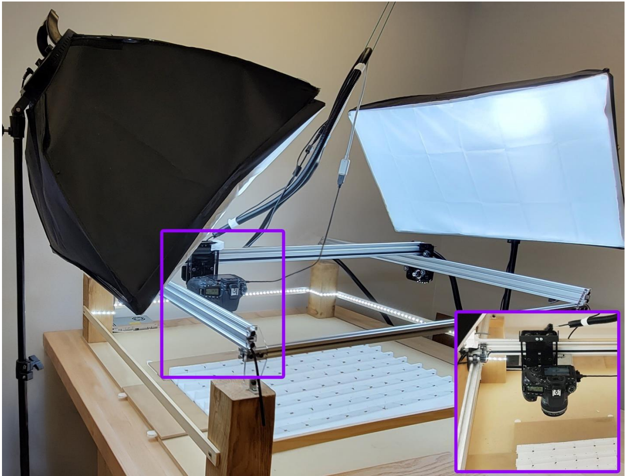
298 Figure 1