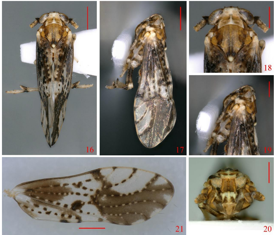
Figures 16–21. Neobelocera parvulua sp. nov. 1 Male adult, dorsal view 2 Same, lateral view 3 Head and thorax, dorsal view 4 Same, lateral view 5 Face 6 Forewing. Scale bars: 0.5 mm (16–17, 21); 0.3 mm (18–20).