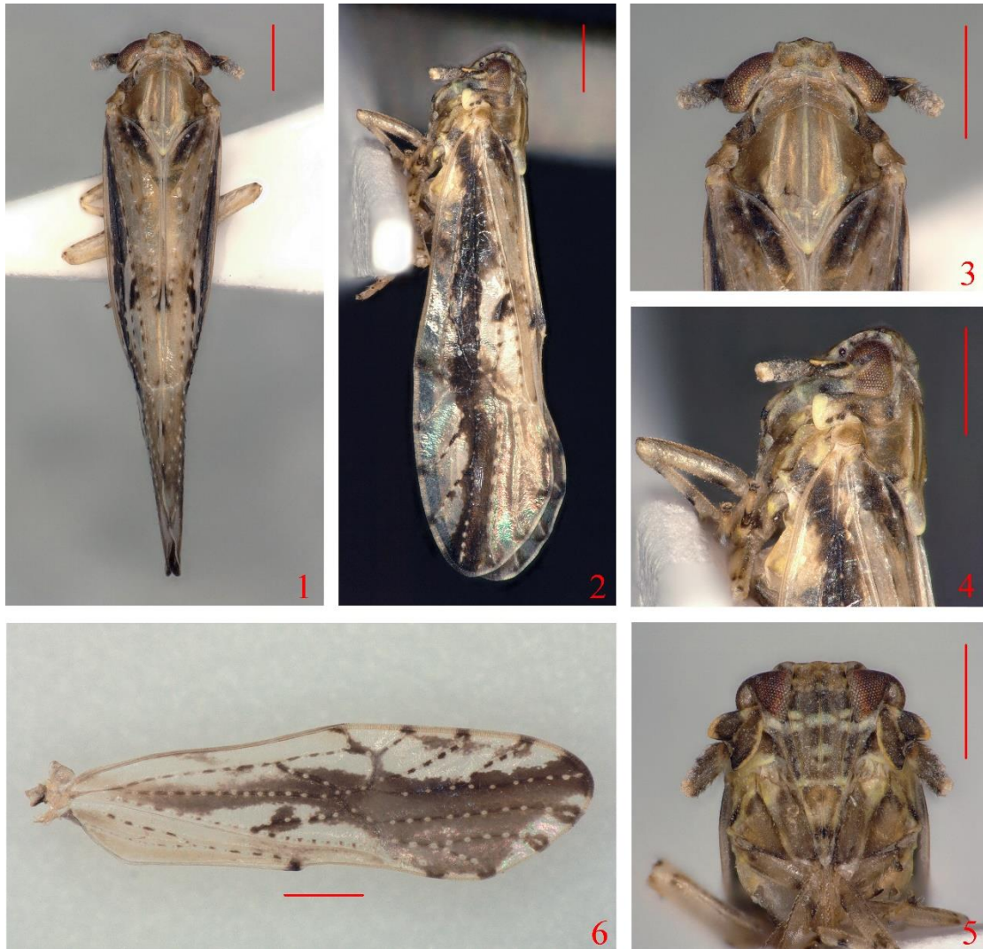
Figures 1–6. Neobelocera furcata sp. nov. 1 Male adult, dorsal view 2 Same, lateral view 3 Head and thorax, dorsal view 4 Same, lateral view 5 Face 6 Forewing. Scale bars: 0.5 mm (1–6).