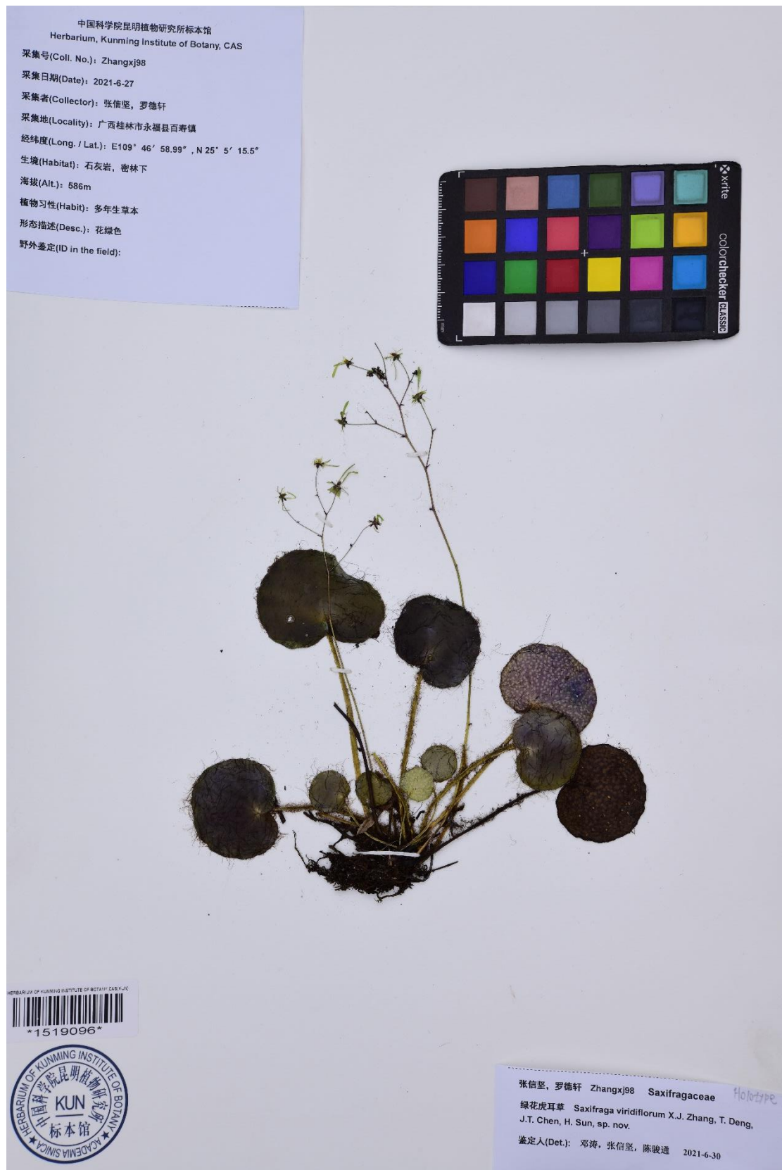
Figure 2. Photograph of the holotype of Saxifraga viridiflorum X.J. Zhang, T. Deng, J.T. Chen, H. Sun (KUN1519096).

base unsheathed; I. Petiole with crisped villous; K&L. Plants and habitat.