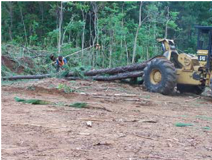
Figure 6. Harvesting residues produced after tree processing in Fiji (Vuki, Visser, 2020)

Vuki, Visser (2020) described that Fiji's current harvesting system includes manual felling and processing into logs by chainsaw, mechanised extraction to the landing (skidding stems using rubber tiered skidders in plantations and bulldozers in native forests) and loading to trucks by the grapple loaders. The harvesting residues are produced in the cut over area (Figure 6) which is seen as a source of biomass to gain additional income for pine plantation growers. Vuki, Visser (2020) indicated that forest harvesting residues would be recovered by conventional and integrated biomass harvesting but did not provide further details.