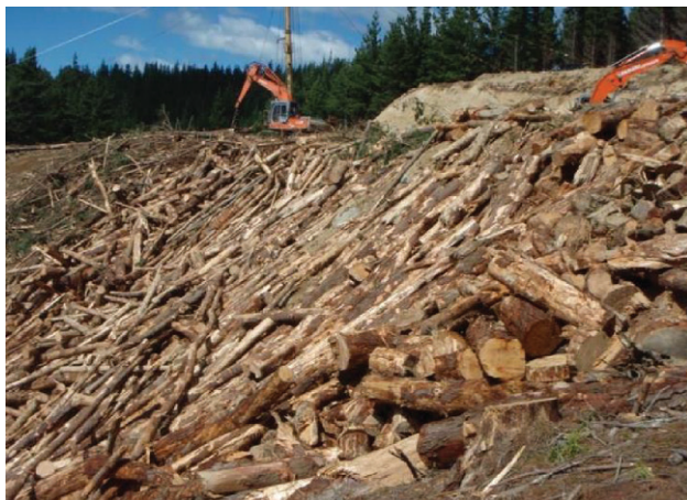
Figure 7. Harvesting residues in cable yarding operations in New Zealand (Visser, 2018)

A summary of reviewed harvesting methods and their work productivity (where available) is provided in Table 1. Globally the popular harvesting residue recovery methods are: chipping residues at roadside/landing and integrated biomass recovery. Forwarders (on flat terrains), cable yarders (on steep terrains) and in-field chippers/grinders are widely applied machines within various recovery methods depending on ground and stand conditions (Table 1).