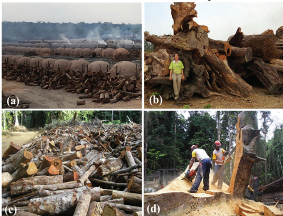
Figure 1. Cutting buttress root to small pieces in Brazil (Numazawa et al., 2020)

Amazon under selective cuttings for every tonne of commercial wood production there are 2.5 tonnes of harvesting residues. Numazawa et al. (2020) indicated that this significant quantity of harvesting residues can be utilised for charcoal/biochar production. Their study was conducted in 13 different sites located in the State of Para in Brazil where harvesting volume ranged from 15 to 30 m 3 per ha. The harvesting residues were collected using forwarders and farm tractors in the study area. The harvesting residues with diameter larger than 10 cm were cut to smaller pieces (approximately 1 m-long sections) to be utilised for charcoal production (Figure 1).