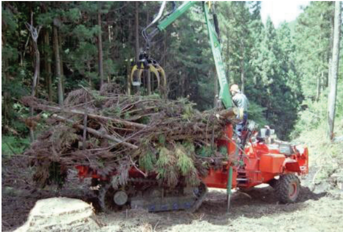
Figure 2. Extracting harvesting residues by a mini forwarder in Japan (Yoshioka, 2020)

After the nuclear disaster in Fukushima in 2011, bioenergy application has been highly extended in Japan. Japanese forest harvesting residues are estimated to be about 4-10 million m 3 per year including harvesting residues and thinning materials left on the sites and if the forest industry is reactivated then a larger volume of residues would be expected (Goh et al., 2020). The cut-to-length harvesting method (using harvester-processor and forwarder) is applied on flat terrains where harvesting residues are collected by the forwarders (Figure 2). Mountainous forests are harvested using the whole tree method applying yarders and tower yarders in Japan. Harvesting residues are mostly concentrated at the roadsides following tree processing that will be then chipped/ground for bioenergy purposes (Yoshioka, 2020; Matsuoka et al., 2021).