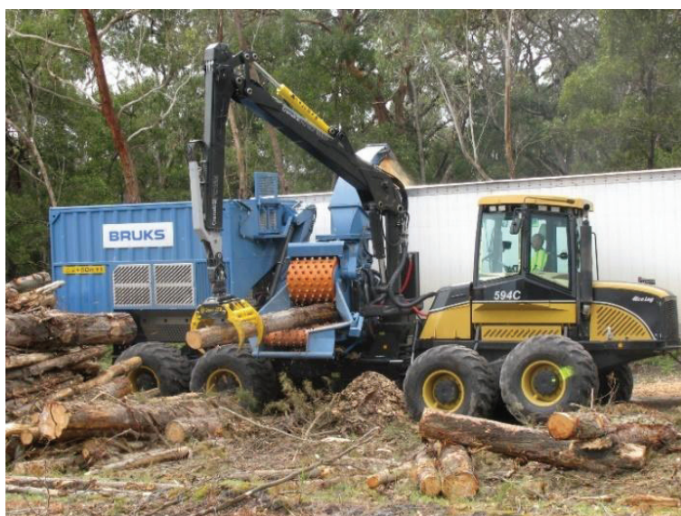
Figure 5. Bruks mobile chipper tested in roadside chipping in Australia