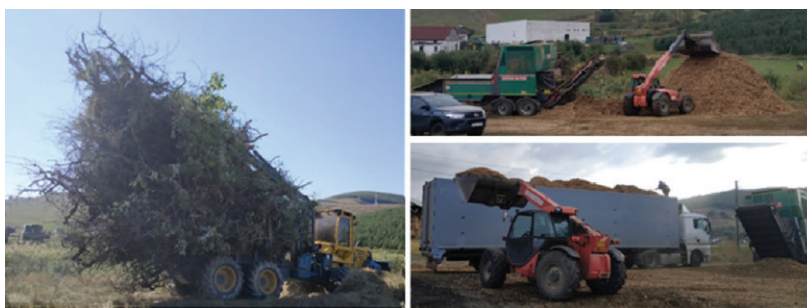
Figure 3. Forwarder, chipper, and loader operating in Orchard residue recovery in Romania (Cataldo et al., 2022)

According to Cataldo et al. (2022), one of the potential biomass resources in Romania could be the residues from agroforestry systems. Apple Orchards cover a large land area and require annual pruning which produces a considerable quantity of woody residues on the farms. Thus, the Romanian researchers tested an innovative solution including a forwarder (to collect and extract Orchard residues from the farm to the roadside), a stationary chipper to chip the harvesting residues on the ground and a telehandler loader to load the chips into trucks for transportation (Figure 3). Their study focused on the work performance of a HSM 208 F forwarder. The average forwarding distance was 830 m and a mean productivity of 21.8 loose m 3 of wood chips per PMH 0 was achieved.