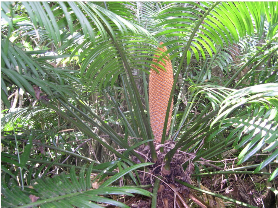
Figure 1. doi

Over the last few decades, the cycad-specific scale pest, Aulacaspis yasumatsui Takagi (Cycad Aulacaspis Scale, CAS), which is native to Southeast Asia, has spread and is infesting cycads throughout many parts of the world (Cave et al. 2022). In some cases, CAS population growth rate is rampant and plants die from continuous scale feeding on most plant tissues. On the Mariana Islands, mortality of Guam's native cycad and only gymnosperm, Cycas micronesica K.D.Hill, was exponential following the invasion by this scale pest in 2003. CAS rapidly spread on cycads throughout the island and, within six years, over 92% of the trees were dead and no seedlings were surviving (Marler and Lawrence 2012, Marler and Krishnapillai 2020). Fig. 1 shows a healthy tree prior to being infested by CAS. Mortality of trees continued and led to the plant's being given Endangered status by the IUCN Red List in 2006 and then later listed under the United States Endangered Species Act in 2015. Other cycad herbivores have added to the decline in health, but CAS remains the major threat to date (Deloso et al. 2020).