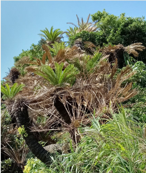
Figure 3. doi

this plant has not placed a major effort focused on biocontrol. However, the evidence of our research from earlier studies presented here clearly point to biocontrol being a major driver of the recovery, with the possibility of some tolerance by trees that survived the early devastation by CAS. Regardless of the outcome of the proposed studies, the answers would provide the evidence to empower decision-makers how to approach future conservation measures. If results of these studies reveal only biocontrol as the cause of the current recovery, then efforts should further promote the use of biocontrol agents in Guam and in other cycad locations where this pest has been introduced. In the event that biocontrol by one or more agents is effective, new leaf flushes (Fig. 3) on the surviving trees should continue to be protected and aid in overall tree recovery.