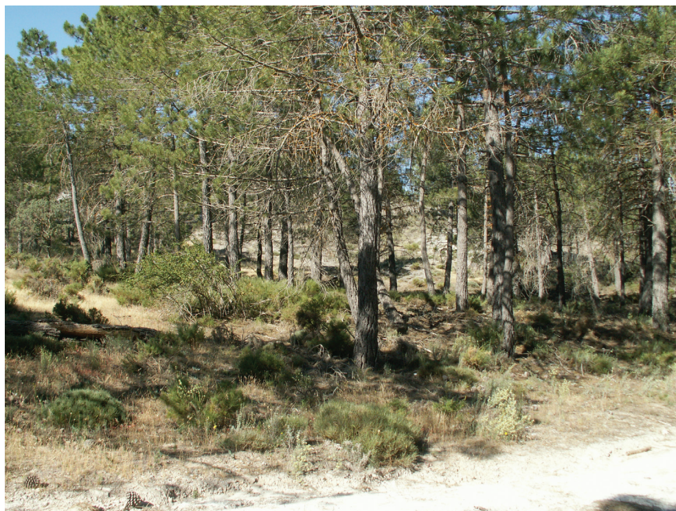
Figure 10. Locality of Cedestis granadensis sp. nov. in Sierra de Huéctor Mts.