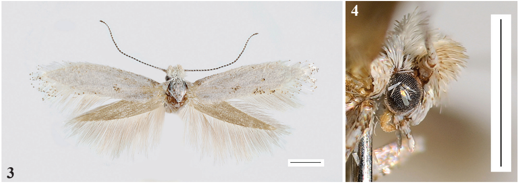
Figures 3, 4. Cestis granadensis sp. nov., female, paratype, Sierra de Huétor Mts., 11.vii.2010, 3. Dorsal view; 4. Head, ventral view. Scale bars: 1.0 mm.