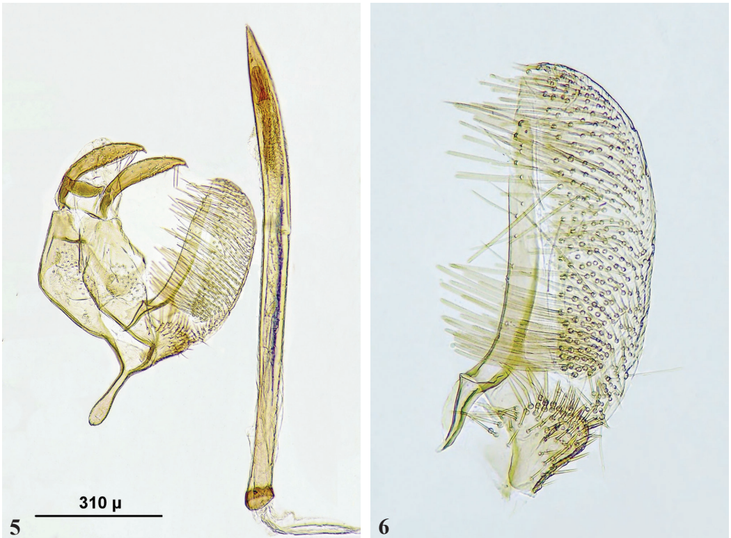
Figures 5, 6. Male genitalia of Cestis granadensis sp. nov., holotype; 5. Ventral view with right valva; 6. Left valva.

with microtrichia between pair of setose humps. Antrum sclerotized, cup-shaped. Ductus bursae moderately long, folded in anterior part, finely papillate anteriorly from three-quarters, gradually expanding into oval corpus bursae with continued papillation posteriorly. Signum large, elliptic with transverse expansion, covered with numerous triangular teeth of various sizes.