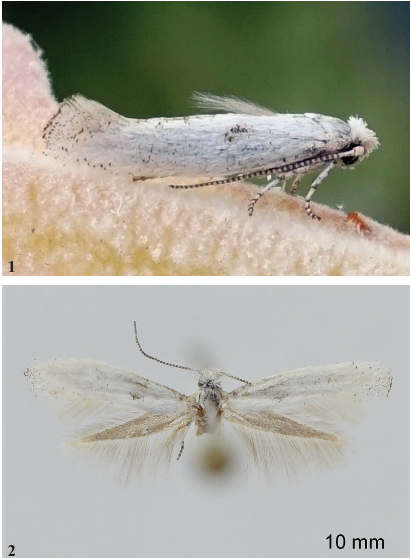
Figures 1, 2. Cedestis granadensis sp. nov., male, holotype, highlands north of Puebla de Don Fadrique, 18.vii.2021, 1. The resting adult; 2. Dorsal view, wingspan 10.0 mm.

Male genitalia (Figs 5, 6). Uncus broad with slightly protruding and rounded lobes; socii long, wider at 1/2–2/3 length, pointed at apex; gnathos small, inconspicuous; valva semi-ovate, costal margin almost straight, sacculus semi-oval; phallus long, slightly curved at 2/3 length, pointed at apex, vesica with triangular cornutus on spatulate structure; saccus relatively short, clavate.