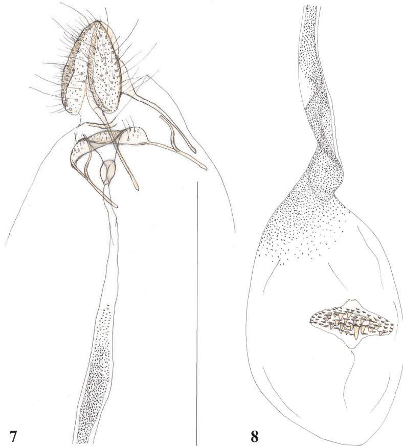
Figures 7, 8. Female genitalia of Cedestis granadensis sp. nov., paratype, Gp. Z. Tokár ♀ 10991. Scale bars: 1.0 mm. Drawing Z. Tokár.

Diagnosis. The male and female genitalia of Cedestis granadensis sp. nov. closely resemble those of C. civitatensis . The male genitalia of the new species differ from the latter mainly in having the broad uncus with slightly protruding and rounded lobes, whilst in the latter the uncus is truncated. In the female genitalia, the new species can be distinguished from C. civitatensis by the longer apophyses posteriores and anteriores and by the form and structure of the lamella postvaginalis, the ostium bursae covered with microtrichia between the pair of small setose humps in the posterior part of the lamella, whilst in C. civitatensis the lamella postvaginalis has another form and structure. The new species is furthermore significantly distinguished from all other known Cedestis species by the white ground colour and sparse pattern on the forewing as well as by large distances in the DNA barcode.