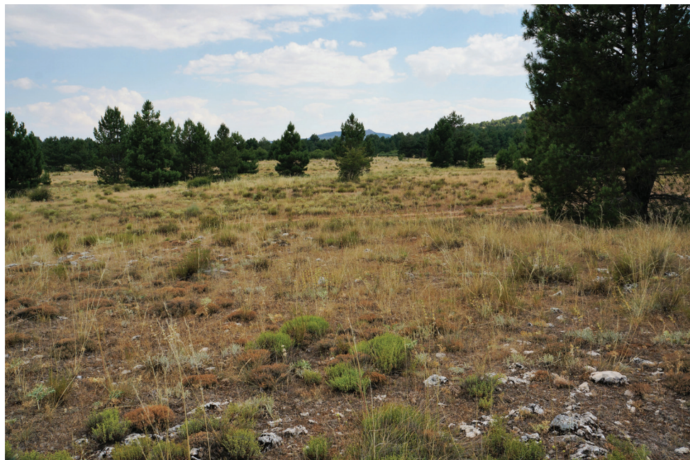
Figure 9. Locality of Cedestis granadensis sp. nov. north of Puebla de Don Fadrique.