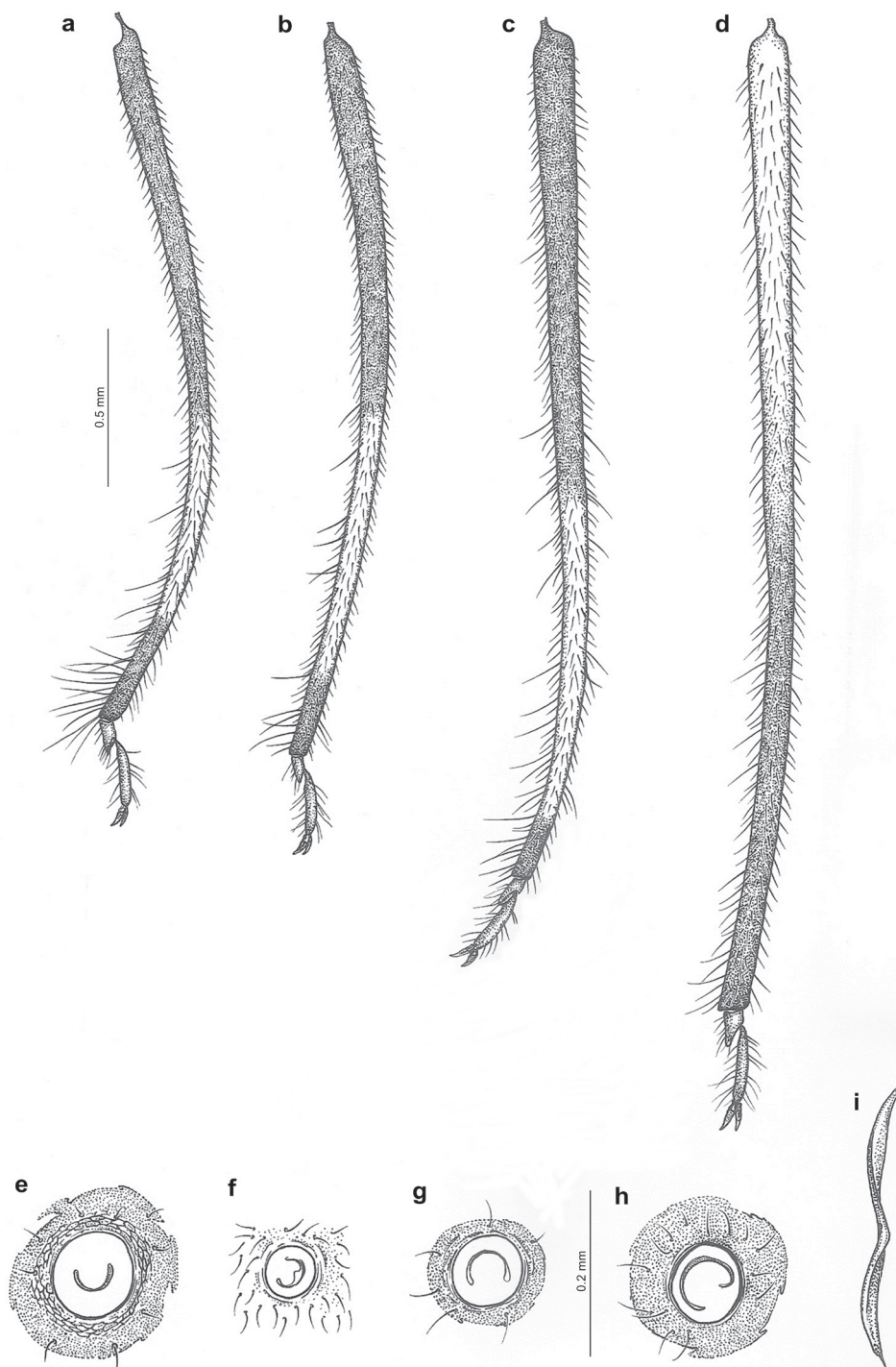
Figure 3. Main differences in pigmentation and chaetotaxy of hind tibiae and size of siphuncular sclerites among apterous viviparous females of the “ pallipes ” group: (a, e) Lachnus pseudonodus Kanturski & Wieczorek, sp. n., (b, f) L. crassicornis , (c, g) L. pallipes , (d, h) L. chosoni , (i) small mesosternal tubercles of L. chosoni .

(Kotschy) Hedge & Yalt. (= Q. aegilops ) and is visited by the ant species Liometopum microcephalum (Panzer, 1798) (Canakçioğlu 1975).