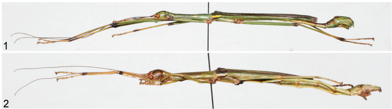
Figures 1–2. Habitus images of Sinophasma damingshanensis sp. n. 1. Male, lateral view; 2. Female, lateral view.

Notes: While only one species occurs in Vietnam, all other twenty-five species and two subspecies are endemic to China.