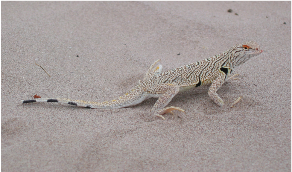
Figure 6. Uma exsul (male). Dunas de Bilbao, Viesca, Coahuila. Species endemic to Coahuila.