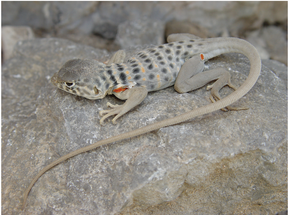
Figure 5. Crotaphytus antiquus (top: male; bottom: female). Sierra de San Lorenzo, Coahuila. Species endemic to Coahuila.