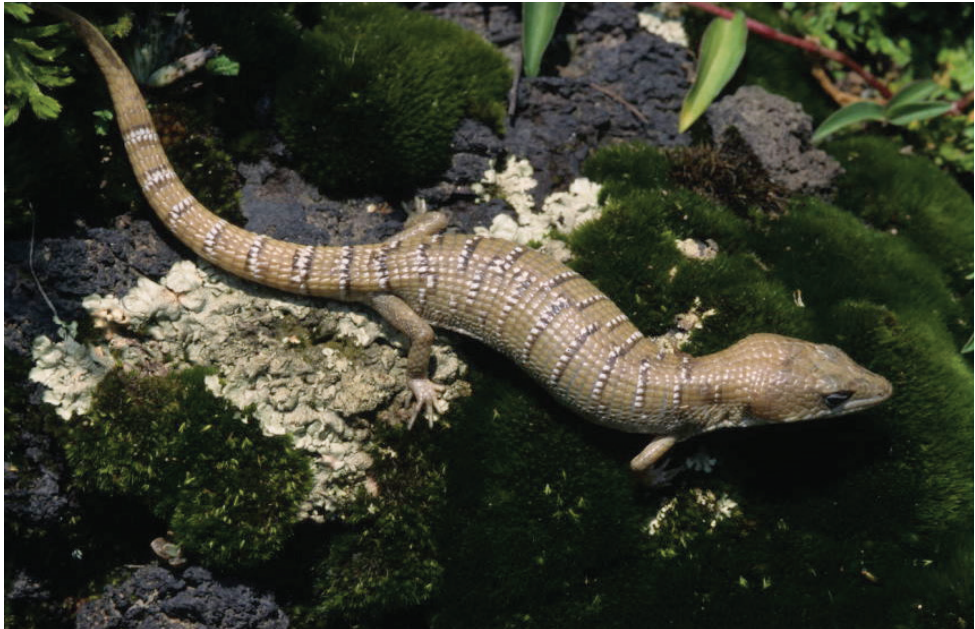
Figure 4. Gerrhonotus lugoi . Cuatro Ciénegas, Coahuila. Species endemic to Coahuila.

Pseudoeurycea galeanae , P. scandens , Eleutherodactylus longipes , Ecnomiobyla miotympanum , Barisia ciliaris , Phrynosoma orbiculare , Sceloporus minor , S. oberon , S. parvus , Plestiodon dicei , Scincella silvicola , Pituophis deppei , Storeria hidalgoensis , and Thamnophis exsul ). These species enter Coahuila only in the southeastern corner of the state.