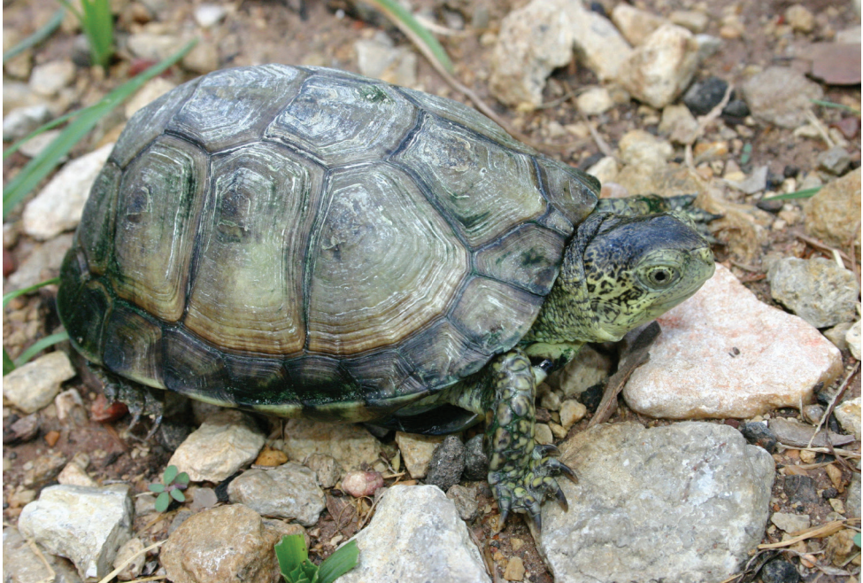
Figure 2. Terrapene coahuila . Cuatro Ciénegas, Coahuila. Species endemic to Coahuila.