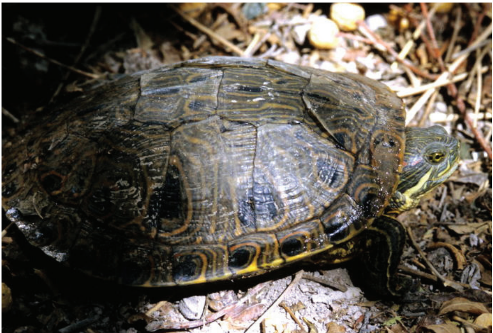
Figure 3. Trachemys taylori . Cuatro Ciénegas, Coahuila. Species endemic to Coahuila.